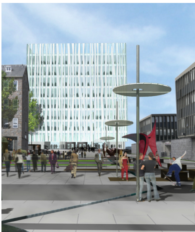
Artist's impression of new library