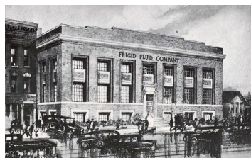
Our new "modern office building"