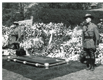
President Franklin D. Roosevelt's Burial in April, 1945