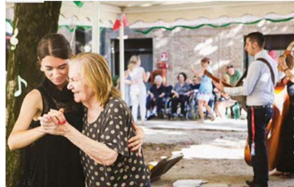
Ferrara Buskers Festival