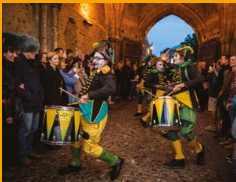
Transe Express, Norwich and Norfolk Festival 2018.