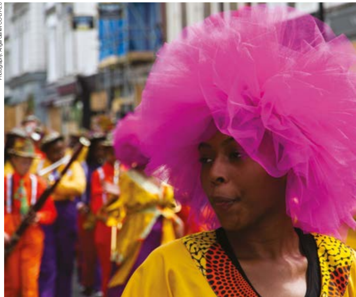
Notting Hill Carnival 2014.

The project's legacy has also been to inspire other grassroots organisation or individuals to donate pianos to local train stations, shopping malls, and city squares, thus continuing to place street pianos amongst us in many places, both locally and globally. Through projects such as 'Play me, I'm Yours', it is possible to see how live art and music can help us to reimagine our public spaces as places of creativity and sharing.