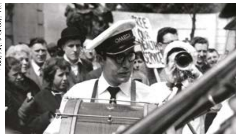
Omega Brass Band, ‘FREE OUR HEALTH SERVICE’ (c. 1962)