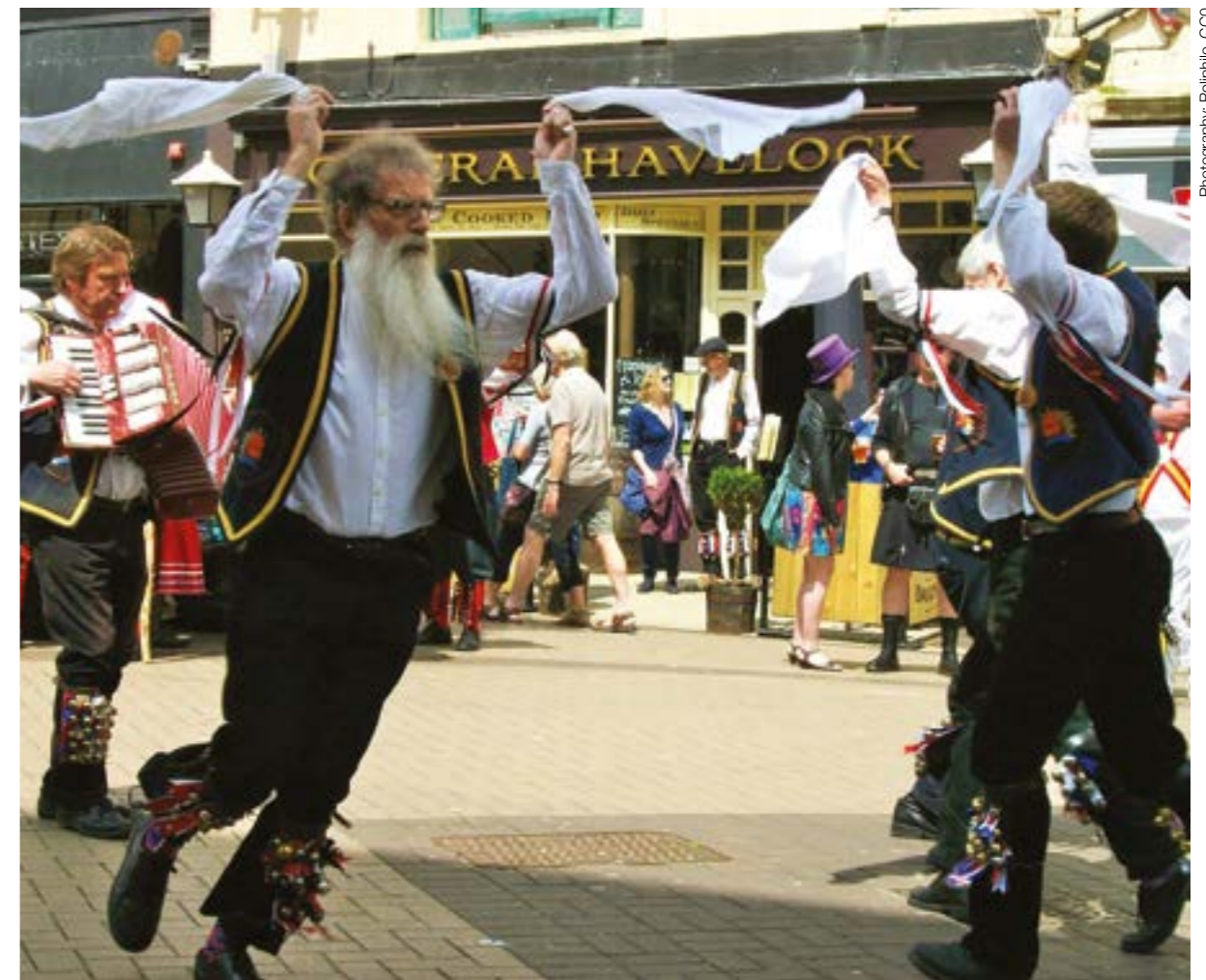
Morris dancers, Hastings, 2014.