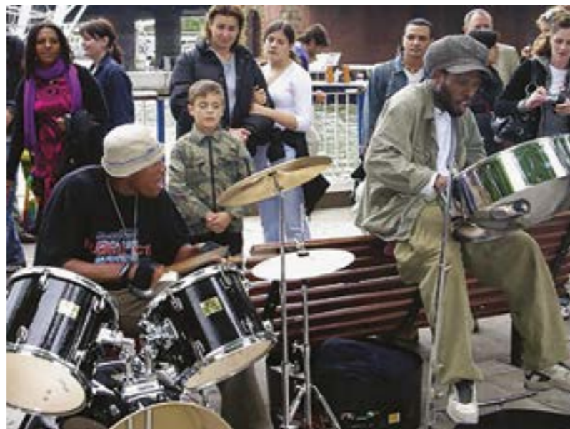
Steel Drummers, London.