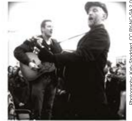
Frank Turner and Billy Bragg busking, London, 2013.

Diverse or unusual instruments are also a feature of street performance. As one London Underground busker from the 1980s put it, 'by playing in public pretty much constantly, I expose many people to instruments they would never otherwise hear. In doing so, I have inspired three people to buy a hurdy gurdy, and