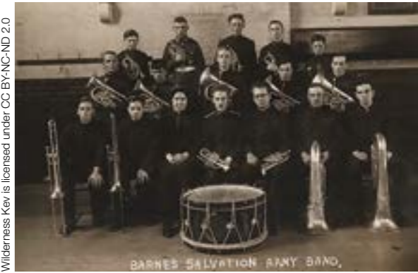
Barnes Salvation Army Band

popular in Northern coal-mining towns during the 19th century; and were often sponsored by industrial concerns. Trevor Herbert views them as highly significant, not least because 'one of the achievements of the brass band movement was that it created what was probably the first mass engagement of working-class people in instrumental art music' (Herbert 2000: 10).