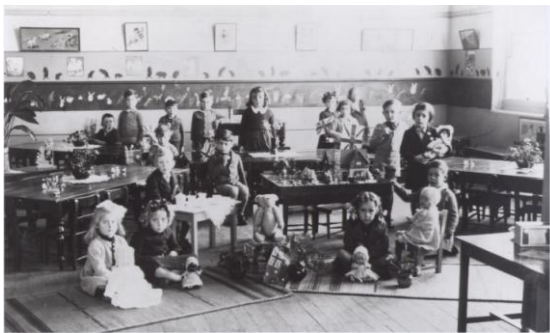
Kindergarten class, Cammeray Public School, 1939.