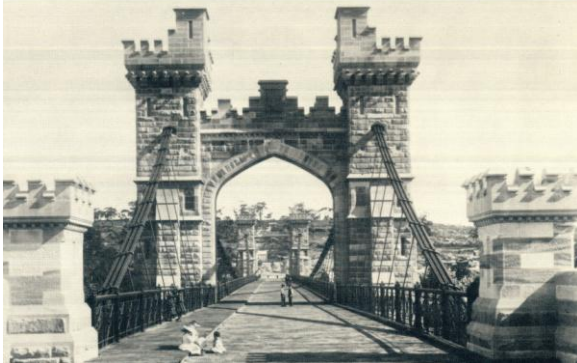
View across the Suspension Bridge, 1905. (North Sydney Heritage Centre, PC 148)

The bridge's designers, W H Warren and J E F Coyle chose an ornate suspension structure which was the largest of its type in Australia at the time and the fourth largest in the world. It took nearly 3 years to build. It had a total length of 775 ft (236 metres), with three spans of 100 ft, 500 ft and 125 ft, respectively, the breadth being 28 ft (8.5 metres). Steel wire cables from turreted sandstone towers supported the bridge.