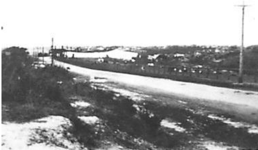
View along Cammeray Road showing the extensive Three Oaks Dairy, 1936. (North Sydney Heritage Centre, PF 712)

By the 1920s the area's name 'Suspension Bridge' was giving way to Cammeray. Estates established in the 1920s and 30s included the Morning Glow Estate (1921), Cammeray Estate (1932) and Green's Estate (1935).