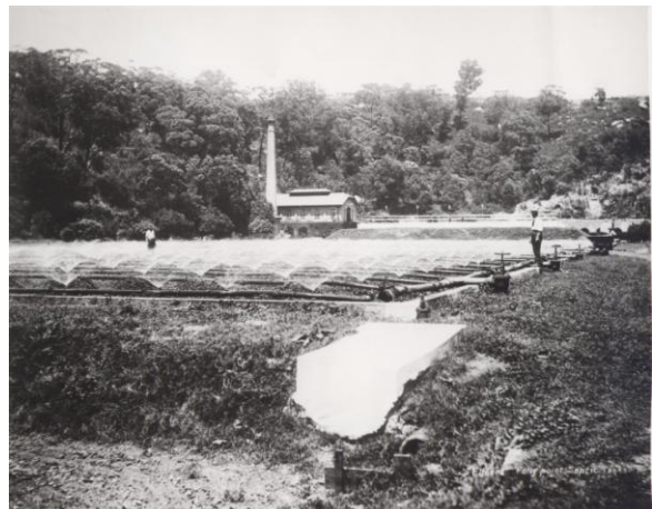
Filter and septic tanks, 1918. (North Sydney Heritage Centre, PF 660).

North Sydney area with an outfall treatment works on vacant land in Willoughby Bay. By 1891 two hectares of Crown land were appropriated at the head of the Bay, with a further 2.6 ha reclaimed by dredging. It was the first sewerage treatment farm on the North Shore.