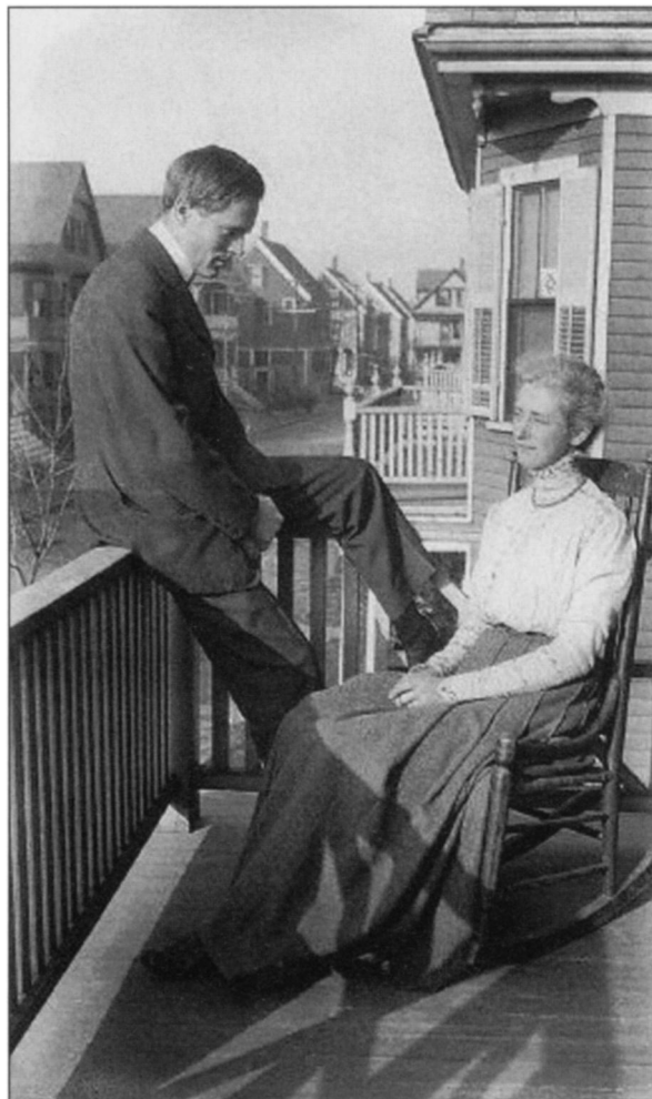
Young couple on porch of suburban home, ca. 1906.