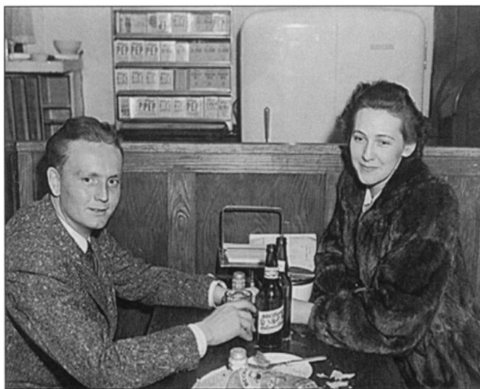
Young couple dine at the Busy Bee Restaurant in Radford, Virginia, 1940.

In some ways parents were right, but it was youth themselves, not parental complaints, that would transform the dating system once again. By the late 1960s, the system of sexual exchange that underlay both dating systems was in tatters, undermined by a widespread sexual revolution. In the 1970s, many young people rejected the artificialities of dating, insisting that it was most important to get to know one another as people . And a great many women, recognizing the implied exchange in Man’s Company + Money = Woman’s Company + ?, rejected that sort of bargain altogether for a variety of arrangements that did not suggest an equation in need of balancing. Since the early 1970s, no completely dominant national system of courtship has emerged, and the existing systems are not nearly so clear in their conventions and expectations as were the old systems of dating. Not always knowing “the rules” is undoubtedly harder than following the clear script of the traditional date, but those critics who