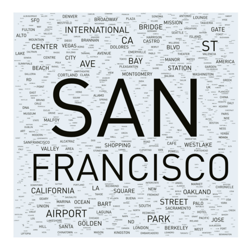
Fig. 2. Word cloud - SF