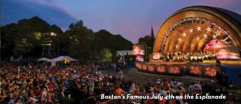
Boston's Famous July 4th on the Esplanade