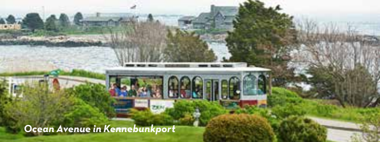
Ocean Avenue in Kennebunkport