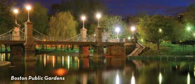
Boston Public Gardens