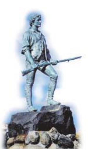
Statue of a minuteman

Looking Back and Ahead News of the battles at Lexington and Concord traveled fast through the colonies. Many colonists saw their hopes of reaching an agreement with Britain fade. For many, the battles were proof that only war would decide the future of the 13 colonies.