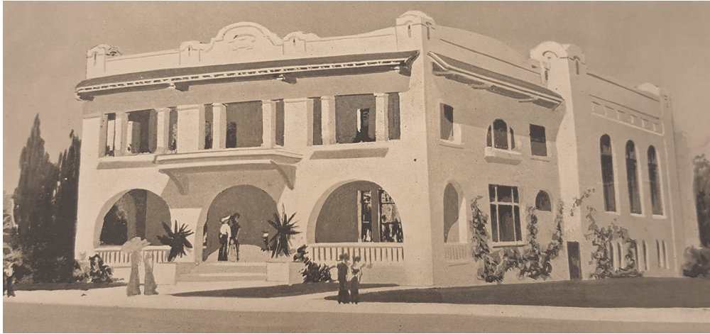
FIGURE 2. Painting of the Tuesday Club's clubhouse, c. 1912.