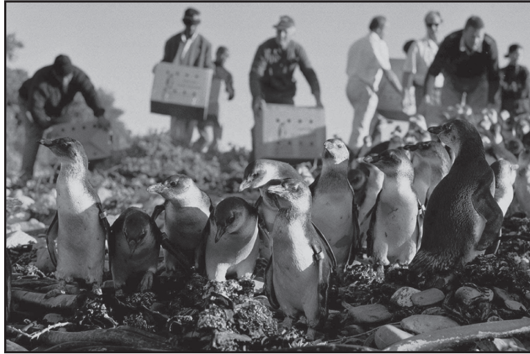
Used by permission.

brushed with a toothbrush. Then the bird gets rinsed under a hose. The whole process takes about an hour. Even with more than 12,500 volunteers, it took a month to bathe all 20,000 birds at the center.