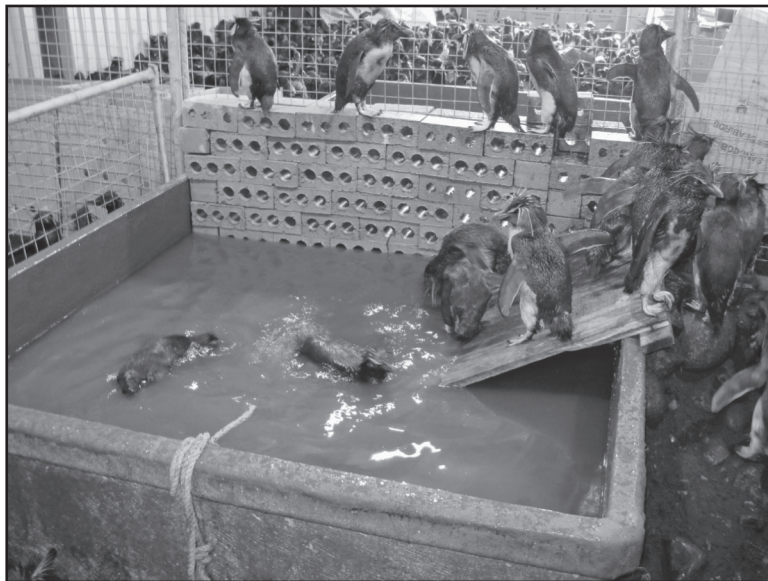
Tina Glass Tristan da Cunha Photo Portfolio www.tristandc.com