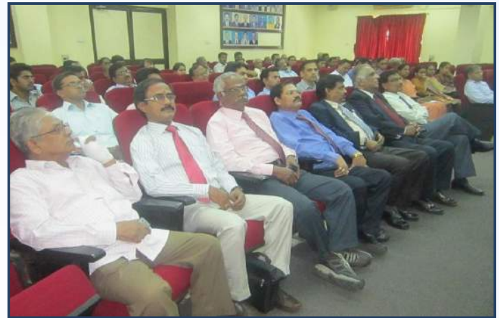
Participants of One Day Seminar cum Panel Discussion on the Companies Act 2013 organised by the ICSI-SIRC in association with SIRC of the Institute of Cost Accountants of India