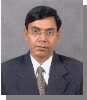
CS K.K. Rao K.K. Rao & Associates Hyderabad

In the case of Kandra Rameshbabu Naidu Vs. Superintendent (A.E.) & Ors. (Bombay High Court), Criminal Bail Application No. 202 of 2014, Pronounced on 05.03.2014 that where the offence is continuing one no bail can be granted. In the instant case, the applicant had collected Rs. 2.59 crores towards service tax during the period 2010-11 to 2013-14 and did not deposit with government except an amount of Rs. 15 lakhs. The assessee had never filed service tax returns and knowingly appropriated the government money for his personal use.