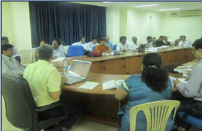
In the Group Reading Programme, members discussing about Secretarial Standards