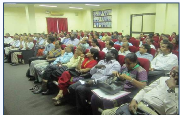
A view of audience at the Meet the Regulator Programme with the Reserve Bank of India Officials