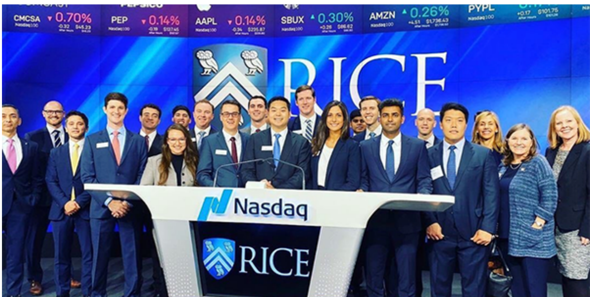
Ring the bell at Nasdaq.

Before you read the updates below, I want to introduce our new tagline, which you may've already noticed or read about. It never hurts to repeat a good story. "You Belong Here" is the new message we've been broadcasting to prospective students. If you're looking to earn an MBA, start with Rice Business. We want them to feel something strong — camaraderie, inspiration and a sense of belonging. Our research tells us this is how students and alumni feel. I hope you do, too. We want the world to know. See how we're spreading the word.