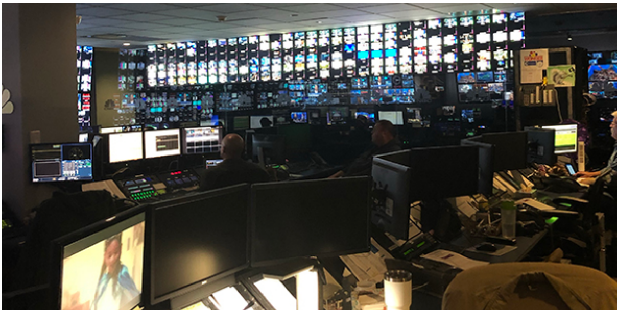
Behind the scenes at CNBC.