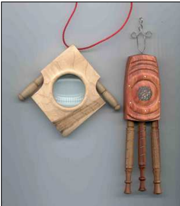
Two tatting accessories. This image was obtained by simply scanning with a Flatbed Scanner.

You can't control shadows, and you may get some reflections from the inside of the camera, but this is so easy you should try it first. It seems almost criminal to get images this effortlessly.