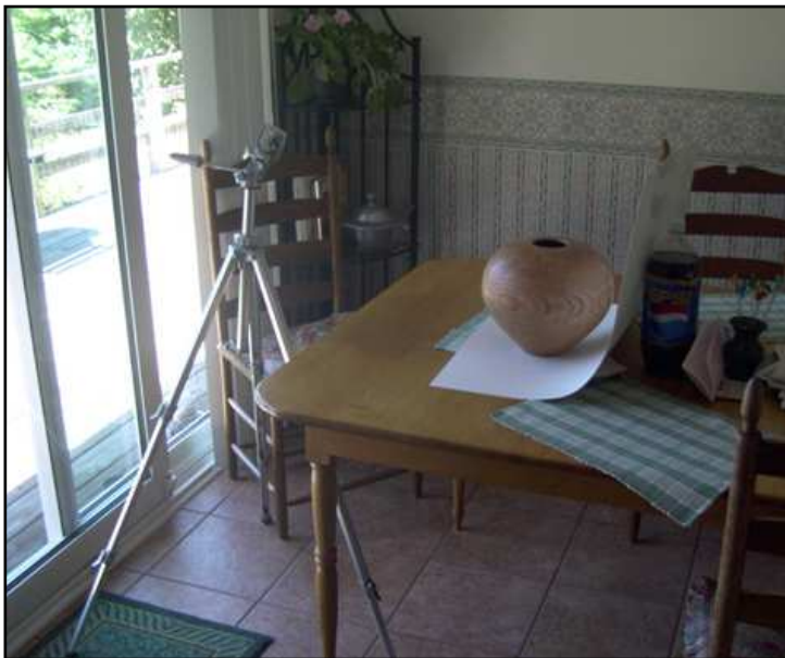
Dining Room Light Box. An easy set-up to get photographs with a seamless background and diffuse light.

The photo below shows my setup to photograph a vessel. I've set it on the dining room table so I don't have to crouch. It faces the patio doors for plenty of indirect light. As it's somewhere near noon, I don't get harsh light direct from the sun. The vessel sits on the front of a sheet of poster board. The back edge is propped up with a two liter Pepsi bottle. As I'm not getting a placement fee, I must point out that Coke, juice, or any heavy article that's a foot high or so will work. Use poster board. Paper, even heavy white Kraft paper, will wrinkle instead of curving gently and may look mottled if backlit at all. The camera is mounted on a tripod to reduce motion. You can increase your odds of a sharp picture by using a cable release or timer.