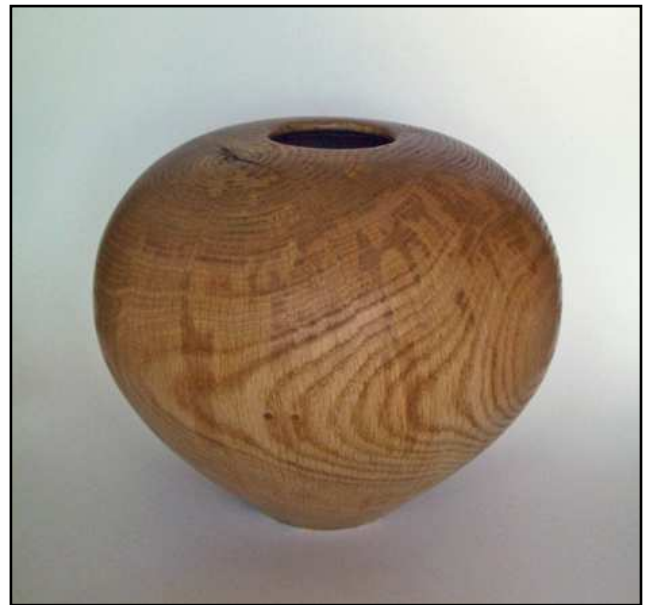
The photograph produced by the set-up above. This is a red oak vessel about 11 inches high and 9 inches in diameter.