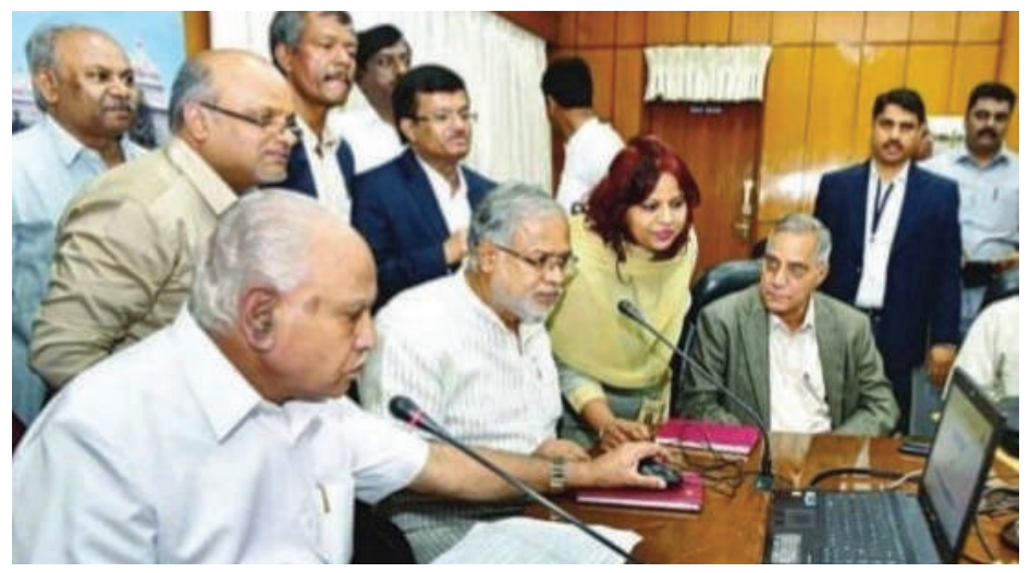
▲ Hon'ble Chief Minister of Karnataka, Shri B. S. Yediyurappa inaugurating the eGazette Portal

automate the supply chain management of drugs procured from Karnataka State Medical Supplies Corporation Limited and supplied free of cost to the patients across Karnataka. At critical stages in the workflow, the data is stored in Blockchain. This includes the POs, the batch ID details, quantity, expiry details, inward and outward details at warehouse and hospitals. The quality test report received from test labs would be updated in blockchain