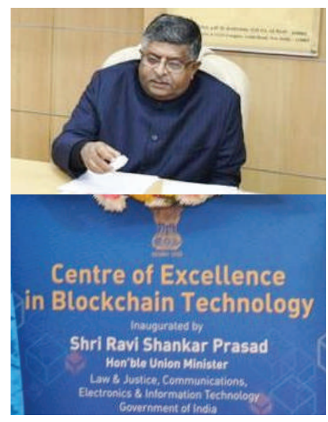
Shri Ravi Shankar Prasad, Hon'ble Union Minister inaugurating the CoE in Blockchain Technology digitally