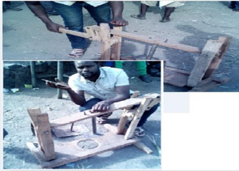
Figure 2 locally produced manual hand press briquetting machine

Hand-press wooden briquetting machine was locally produced in furniture producing workshop of Hawassa University Wondo Genet College of Forestry and Natural Resource, southern Ethiopia as shown in cross section in Fig. 2.