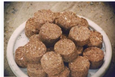
Figure 4 produced briquettes

Biomass briquettes were developed by solidifying the mash in the mould using locally developed manual hand press briquetting machine. Twenty biomass briquettes were essentially developed in the Laboratory of the college. An illustrative view of the briquettes produced is presented below.