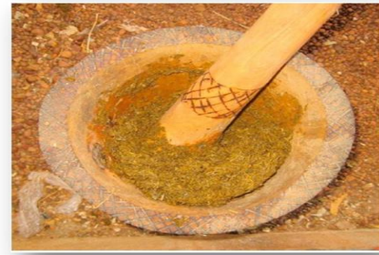
Figure 3 Materials broken down with a grinder

In order to produce briquettes from biological wastes, bio-material are required to be grinded and pounded to provide a arbitrary allotment of fibers, ahead of being reformed into briquettes. Biological wastes are required to be chopped, partly decomposed, soaked and pulped. This is just to form a charge of wet material for the mould, Materials particularly bagasses, Fruits peels and saw dust collected were sundried to reduce moisture content to approximately 12% which is within the tolerable operating limit for briquetting [16] 16 . Grinder was used to reduce the materials to smaller sizes and paper was manually chopped in to pieces.