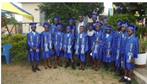
P6 Graduates of 2017