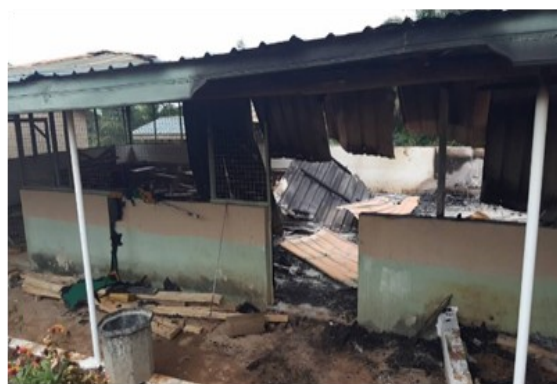
The damaged Multi-purpose hall and classroom