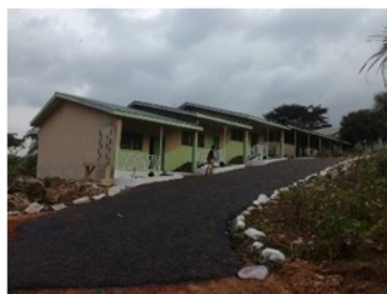
The summer building project