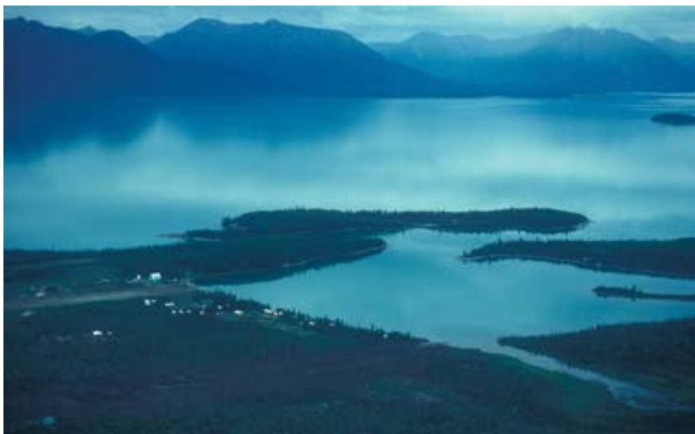
An aerial view of Port Alsworth looking north across Lake Clark toward Kijik Mountain, center background, with Bee Alsworth's new landing strip under construction in the center foreground