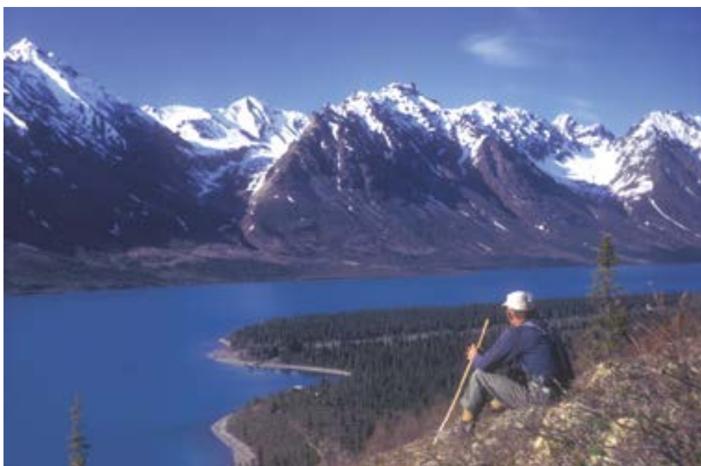
RLP overlooking Carrithers' point with Allen Mt., Spike's Peak, Glacier Creek, Bell Mt., and Bell Creek in the background