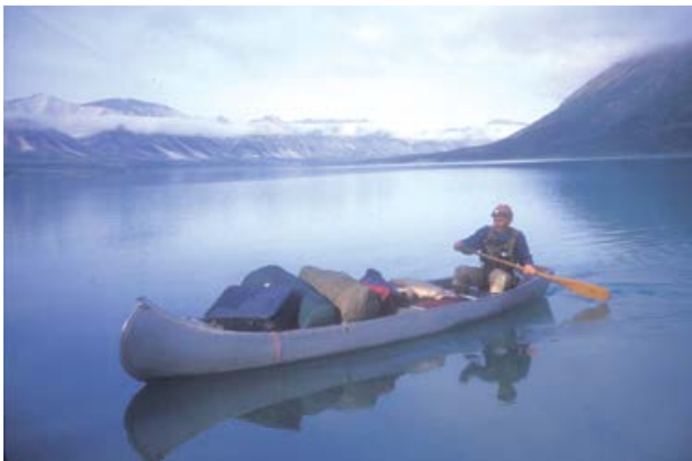
RLP in his loaded canoe 1991