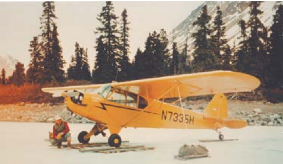
Below: RLP kneels in front of the J3-Piper Cub on the ice near his cabin in the spring of 1976