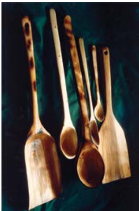
Woodenware carved by RLP