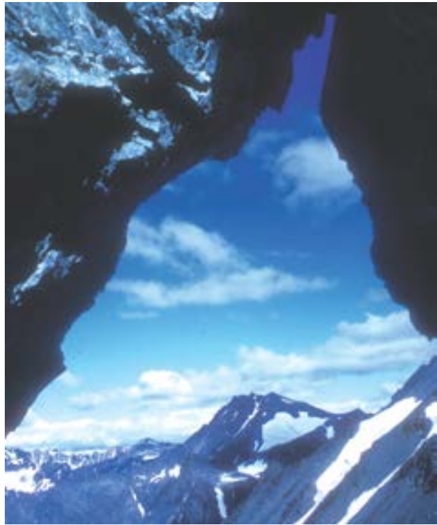
Proenneke's "eye of the needle" arch near Low Pass