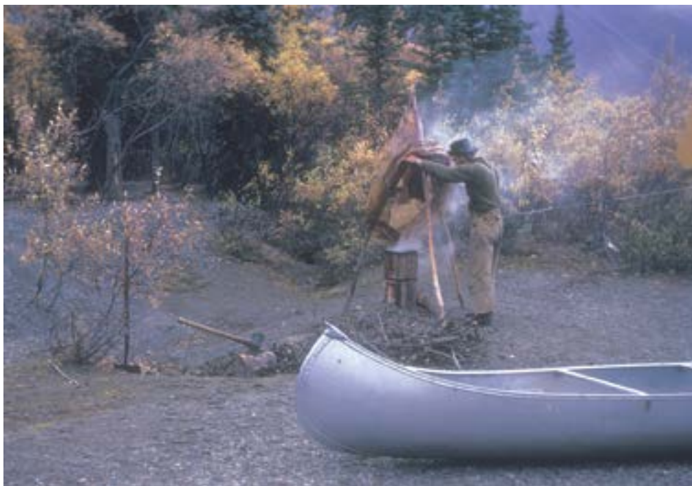
RLP smokes meat on the beach near his cabin circa 1976