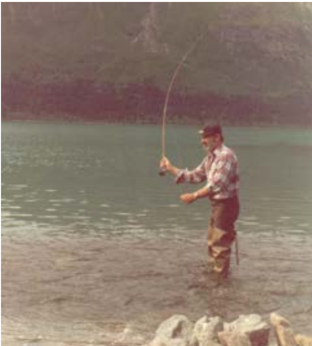
Governor Jay Hammond fishing at the mouth of Hope Creek circa 1980