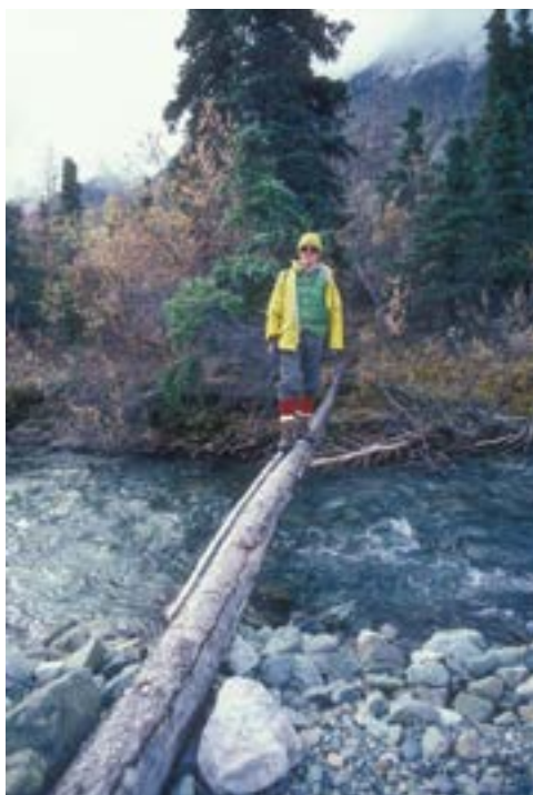
A hiker crosses Proenneke's Hope Creek bridge in 1982