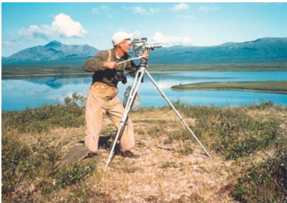
RLP filming at Snipe Lake 1975