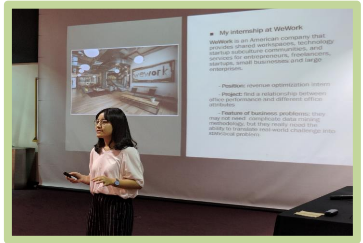
Wanting Tan Internship at Wework.