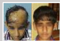
Before After No. Of Follicular unit: 4000 FU Result after: 9 month