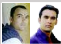
Before After No. Of Follicular unit: 3000 FU Result after: 9 month

"Dermaclinix feel extreme pleasure to launch INDIA's largest hair restoration center with state of art infrastructure in heart of DELHI"