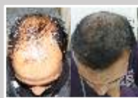
Before After No. Of Follicular unit: 6000 FU Result after: 9 month