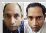
Before After No. Of Follicular unit: 4000 FU Result after: 9 month