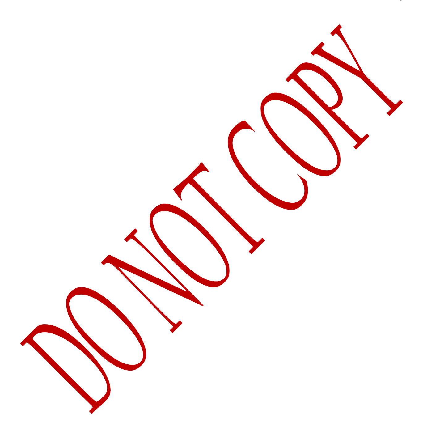
Page 1 of 4