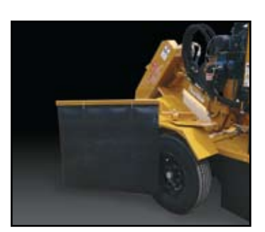
Swing-Out Chip Retainers