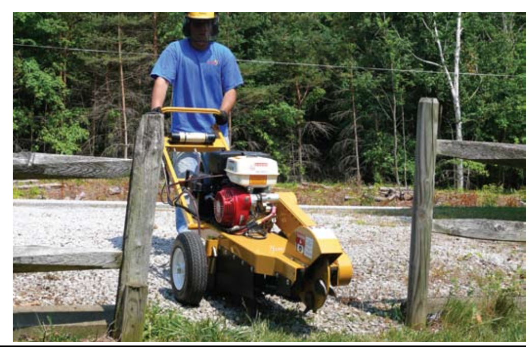
RG13 Series II