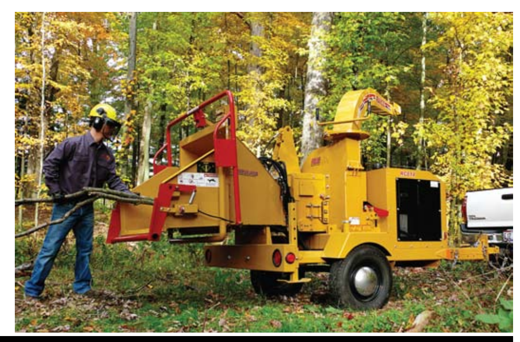
RC6D25 • RC6D35