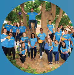
Clubs and Associations