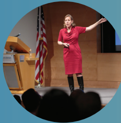
Distinguished Guest Speakers