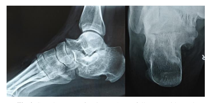
Fig 4: Sample x-rays of patient at 1 year follow-up with good functional outcome score