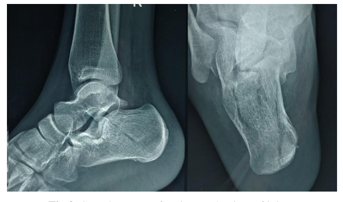
Fig 3: Sample x-rays of patient at the time of injury

The study had limitations such as the limited number of cases, due to which obtaining statistically significant inference was difficult. Both open and closed cases were included in the study and considered together for outcome analysis. The outcome was not analyzed as per Sander's classification since the number of cases were few. Limited follow-up period of one year does not allow us to generalize the results.