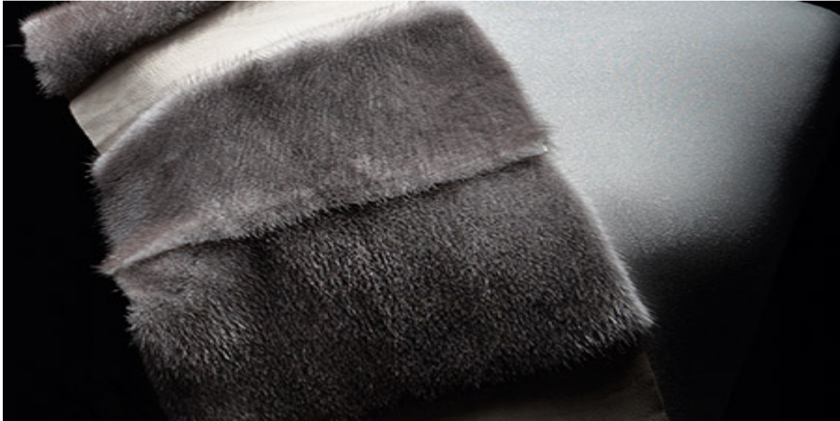
Variation: Split Skin- Flank to Belly