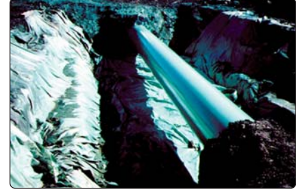
Completed pipe coating rehabilitation using 3M^{\text{TM}} Scotchkote ^{\text{TM}} .