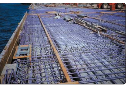
3M™ Scotchkote™ 426 coated rebar in naval pier prior to concrete pour.