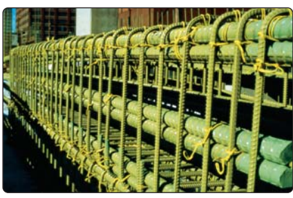
Rebar coated with 3M™ Scotchkote™ 413.