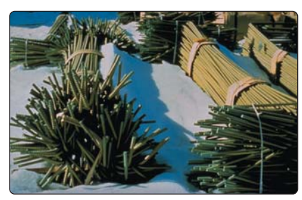
3M™ Scotchkote™ coated rebar ready for installation

Scotchkote 413SG Spray Grade Coating is designed for application on welded wire fabric, mesh, chair assemblies, dowel baskets, cable-tensioning hardware, screw anchors and coupling devices. The coating possesses high flow capability without sag for maximum penetration into wire intersections and coverage on sharp weld cusps. Gel and cure time and have been extended to aid in this process, therefore the coating must be postbaked. Scotchkote 413 Spray Grade meets/exceeds all standards for coating of reinforcing steel prior to fabrication