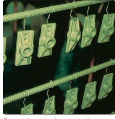
Post-tensioning hardware coated in accordance with AASHTO and ASTM specifications with 3M™ Scotchkote™ 413 spray grade.

3M tests Scotchkote products for properties such as adhesion, impact strength, hardness, thermal shock, abrasion resistance, penetration and chemical resistance. In many cases, results are confirmed by independent laboratory investigation. For more information on test results please refer to the specific product data sheet. Before use, you must evaluate the coating to determine if it is suitable for your intended application.