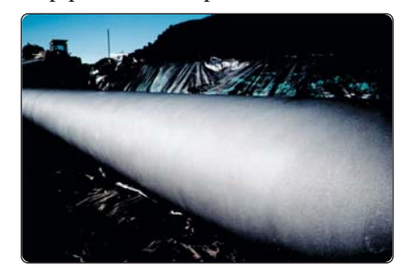
Cleaning pipe to a white finish for a rehab project.

Field application of FBE coating on girth welds provides a matching level of performance quality as plant-applied materialsthe pipeline can be protected with the same coating from end to end.