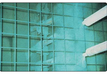
3M^{\text{TM}} Scotchkote* 413 spray grade being applied to wire mesh.