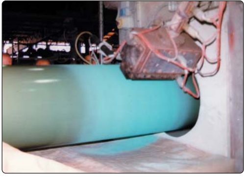
Application of topcoat 3M™ Scotchkote™ 207R to