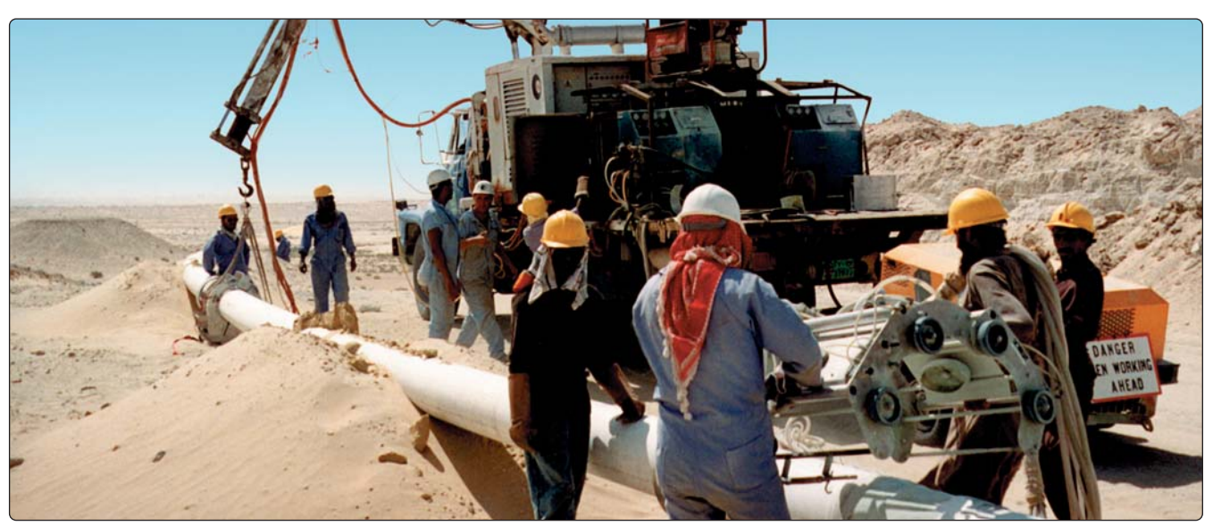
Pipe coated with 3M™ Scotchkote™ Fusion Bonded Epoxy as the primary layer, polypropylene copolymer adhesive and polypropylene overcoating.

Scotchkote 6258 is a special epoxy coating engineered to maximize elevated temperature performance of multilayer pipeline coating systems. In addition to adhesion promoting agents, Scotchkote 6258 utilizes epoxy-novolac chemistry to increase cross-link density. The result is a base coating with a glass transition temperature/softening point that is significantly higher than standard fusion bonded epoxy materials.