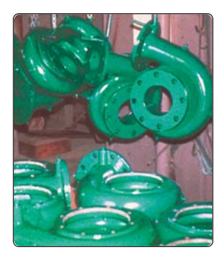
Pump volutes protected against corrosion with 3M™ Scotchkote™ 134.