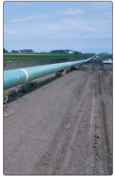
The Alliance Pipeline in Minnesota, coated with 3M™ Scotchkote™ 6233.

Scotchkote 6233 is a significantly advanced, high-performance fusion bonded epoxy coating. It incorporates 3M's latest formulation technology, utilizing special adhesion promoting agents to enhance cathodic disbondment resistance in all conditions, especially elevated temperatures/wet environments. Scotchkote 6233 adheres under the stress of changing