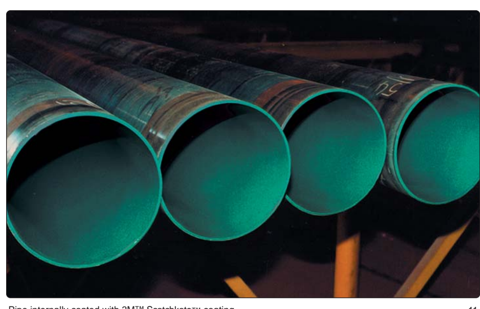
Pipe internally coated with 3M™ Scotchkote™ coating.

Scotchkote 500N Water Base Primer is a water-based metal treatment designed to increase adhesion of fusion bonded epoxy coatings. Properly applied to blast-cleaned steel, it provides protection for metal surfaces and a uniform bonding base for increased coating performance. This primer significantly improves hot water resistance, autoclave resistance, and cathodic disbondment and salt spray resistance of the coating. It is easily applied with minimal application equipment and promotes a chemically uniform steel surface condition.