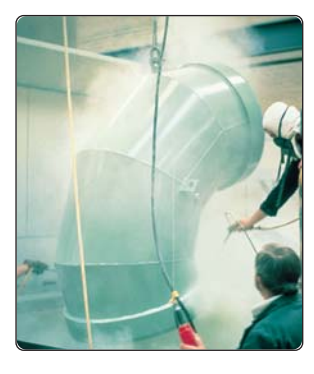
Fluid bed dip application of 3M<sup>™</sup> Scotchkote<sup>™</sup> 206N.