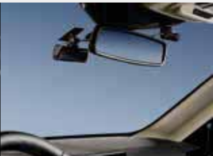
Dash cam systems 1