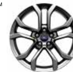
18" PREMIUM PAINTED ALUMINUM Ⓞ Standard

LEATHER-TRIMMED SEATING SURFACES: Russet, Ebony