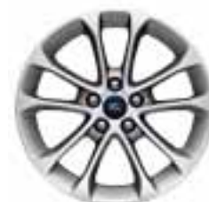
17" SPARKLE SILVER-PAINTED ALUMINUM Ⓢ Standard