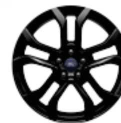
18" EBONY BLACK-PAINTED ALUMINUM Ⓢ Included with SE Appearance Package

Available equipment shown. 1 Available feature. 2 Don't drive while distracted. Use voice-operated systems when possible; don't use handheld devices while driving. Some features may be locked out while the vehicle is in gear. Not all features are compatible with all phones. 3 Additional charge. 4 Metallic. 5 Certain restrictions, 3rd-party terms and data rates may apply. See footnote 1 on the "Your Tech, Your Way" pages, and your Ford Dealer for details. 6 Restrictions may apply. See your dealer for details.