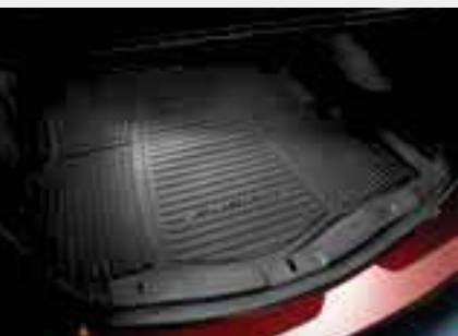
Cargo area protector

New Vehicle Limited Warranty. We want your Ford Fusion ownership experience to be the best it can be. Under this warranty, your new vehicle comes with 3-year/36,000-mile bumper-to-bumper coverage, 5-year/60,000-mile Powertrain Warranty coverage, 5-year/60,000-mile safety restraint coverage, and 5-year/unlimited-mile corrosion perforation (aluminum panels do not require perforation) coverage – all with no deductible. Fusion unique electric components are covered during the Hybrid/Electric Unique Component Coverage, which lasts for 8 years or 100,000 miles, whichever occurs first. Please ask your Ford Dealer for a copy of these limited warranties.