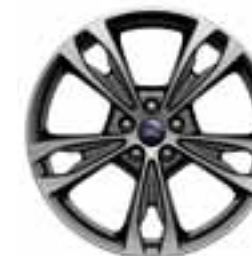
19" MACHINED-FACE ALUMINUM WITH MAGNETIC-PAINTED POCKETS Ⓞ Standard