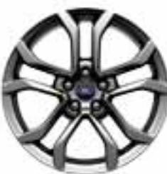
18" PREMIUM PAINTED ALUMINUM Ⓢ Standard

ACTIVEX SEATING SURFACES: Medium Light Stone, Ebony