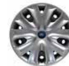
16" STEEL WITH SILVER-PAINTED COVERS Ⓞ Standard