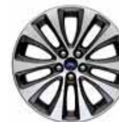
18" MACHINED-FACE ALUMINUM WITH MAGNETIC-PAINTED POCKETS Ⓢ Included with All-Wheel Drive Package