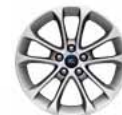
17" SPARKLE SILVER-PAINTED ALUMINUM Ⓢ Standard

CLOTH SEATING SURFACES: Medium Light Stone, Ebony, Light Putty/Bold Brown Vinyl