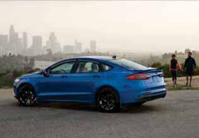
SE with SE Appearance Package in Velocity Blue accessorized with molded splash guards and smoked side window deflectors, as well as the rear decklid spoiler and 18" Ebony Black-painted aluminum wheels that are part of the SE Appearance Package