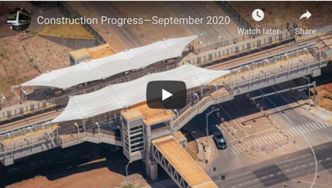
Our latest construction update video is now on YouTube ! Check out the current progress of the rail project along the westernmost section of the alignment, including stations and guideway, from East Kapolei to Lagoon Drive areas.