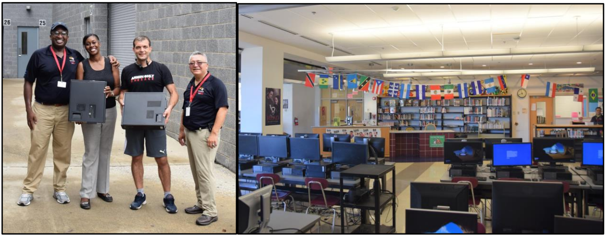
Computers donated to Bladensburg High School

• Oct 2018 - 535 computers and accessories valued at over $535,000 donated to the Town of Bladensburg in Prince George's County for distribution to three public schools and the Bladensburg Community Center.