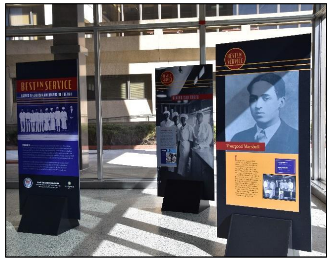
"Best in Service" celebrating Black History Month