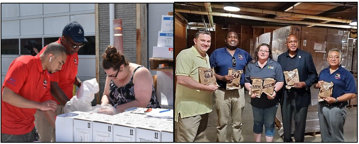
Sharps delivery to Cambridge & Meals Ready to Eat (MREs) delivery to Anne Arundel Food Bank