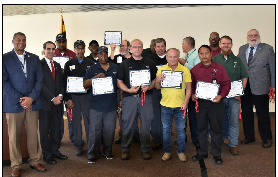
Pipe Replacement Team, Baltimore Facilities Operations & Maintenance June 2019