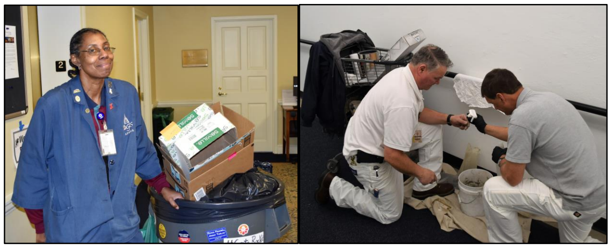
Getting things in order for the 2019 General Assembly Session

The Facilities Operations and Maintenance Division is on call 24/7 to respond to building emergencies. In addition, the division routinely adjusts its schedules (housekeeping, maintenance, painting, electrical work, etc.) to accomplish their duties with minimal disruption to employees and the general public. For example, the State House, House of Delegates and Miller Senate Building get a thorough inspection for needed repairs and a top-to-bottom cleaning prior to the first day of Session.