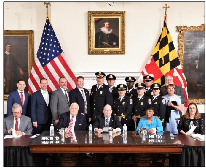
Bill signing, April 18, 2019