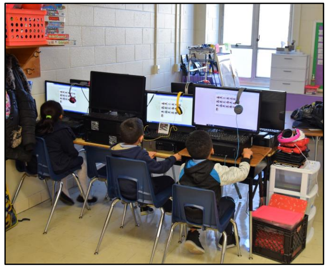
Students at Templeton Elementary School work on donated computers

• 2nd half of 2018 - General Services delivered more than $2.5 million in federal surplus property, including computer equipment and furniture, to Marylanders in need, public schools, non-profit organizations, municipal agencies, federally-certified 8(a) firms.