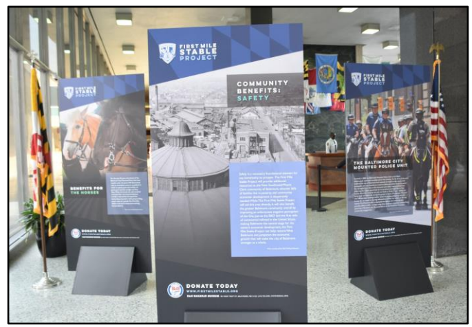
"First Mile Stable Project"