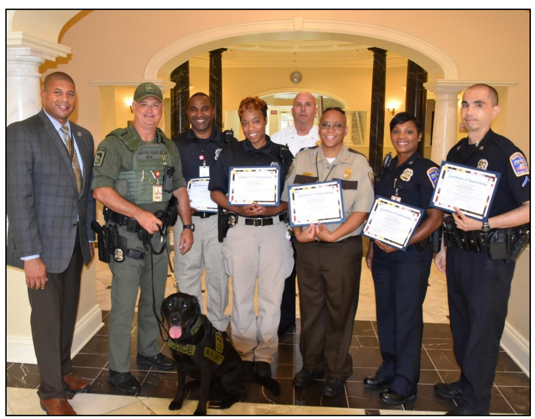
Members of the Annapolis Detachment, Maryland Capitol Police August 2019 Employees of the Month