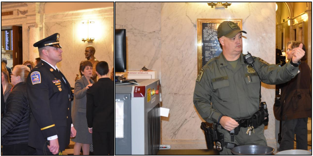
2019 General Assembly - First Day of Session Maryland Capitol Police ensure the safety of elected officials and visitors to the State House

The Maryland Capitol Police operate on a 24/7 basis, ensuring the security of General Services facilities in Baltimore and Annapolis and the safety of employees and visitors. Being on location around the clock allows them to respond immediately to calls for service.