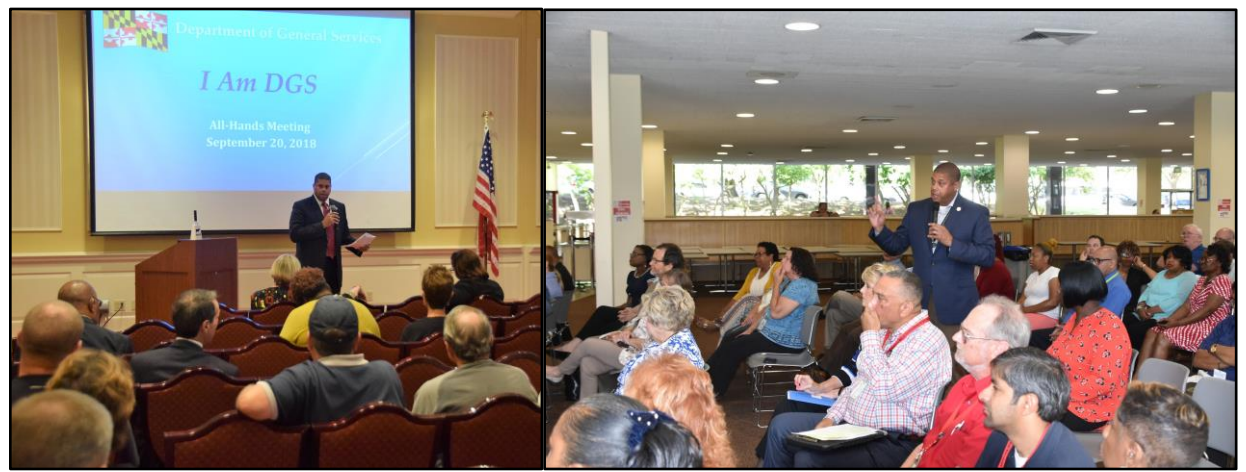
Annapolis All Hands