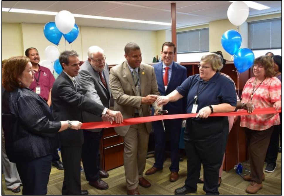
Ribbon Cutting for new office, September 18, 2018