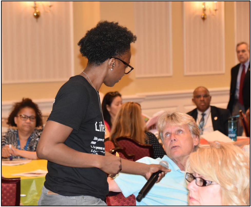
Customer Service Training, Annapolis May 21, 2019