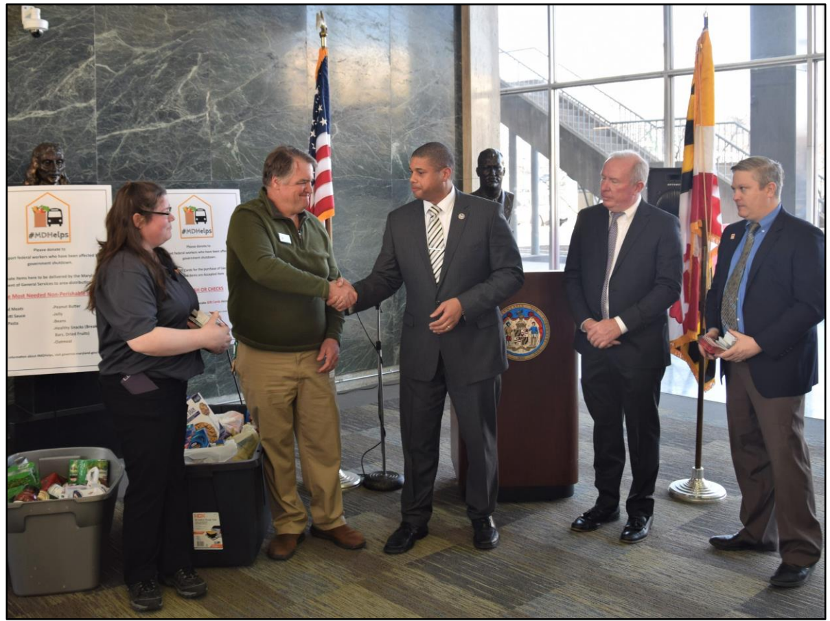
Local nonprofits at State Center to receive donations for distribution to impacted federal employees.

• DGS organized a food and gift-card drive with 15 drop-off locations in state-owned buildings across Maryland; collected items were distributed to local food banks.