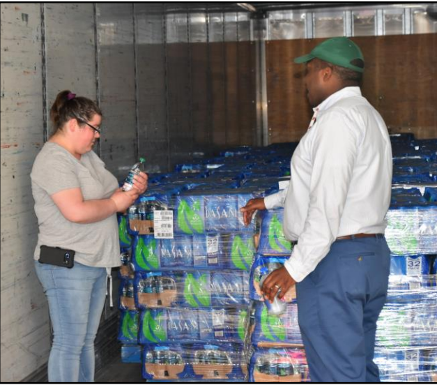
Water Delivery to Anne Arundel Food Bank