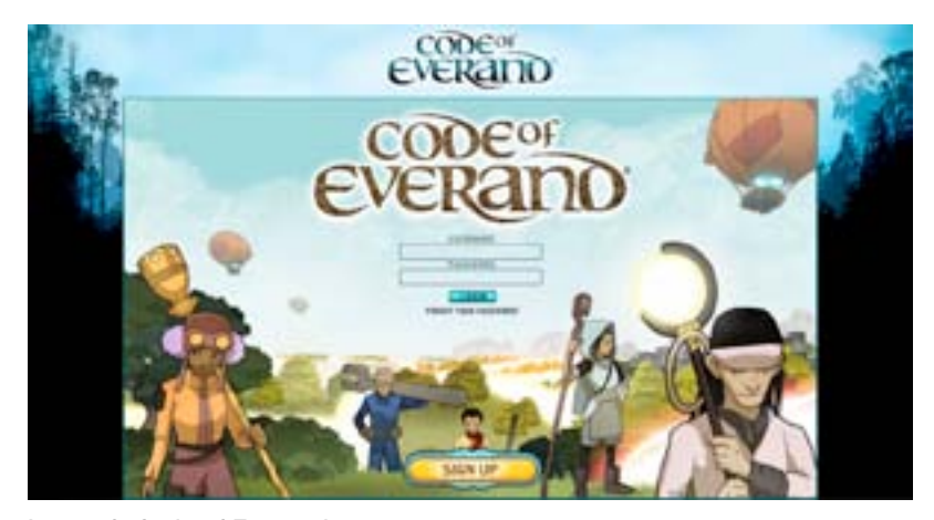
Image 2: Code of Everand

children through as many channels as possible. [...] We found it was also important to have that direct relationship with children where they weren't being told to do it, but they were electing to do it."