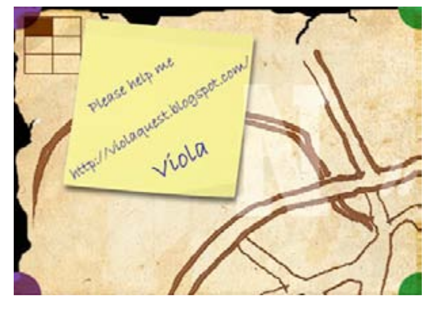
Image 5: A postcard and part of the map of the Alternate Reality Game ARGOSI

[Alternate Reality Games] is make sure there's a balance of those, something in there for everybody. [...] Some people will like different, not mutually exclusive [elements]. One person might like a bit of competition and some creativity but really, really hate puzzle solving 'cause it's too hard for them to do. [...] I don't think you can have a game that everybody will like, but what you can have is a game where you're at least providing a bit of something for everybody."