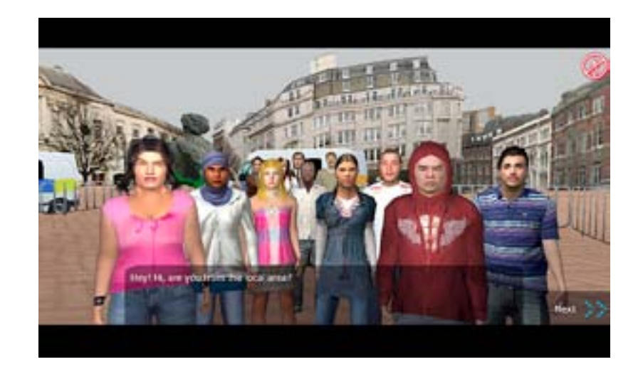
Image 4: Choices and Voices

"It's about interaction. It's so much more rewarding, knowing that there's another person, that you're interacting with a real person, even if you can't see them. [...] If you play some of the two-player games, on Yahoo you can play chess or backgammon, you never see the other person. You just play chess, but you know the other person that's moving it is another human being, so when you put them into check mate, you know that they're sat there going, 'Damn it! I lost!', and you know how that feels, and they know how you feel because you've triumphed, and that's so much more rewarding than playing against the computer."