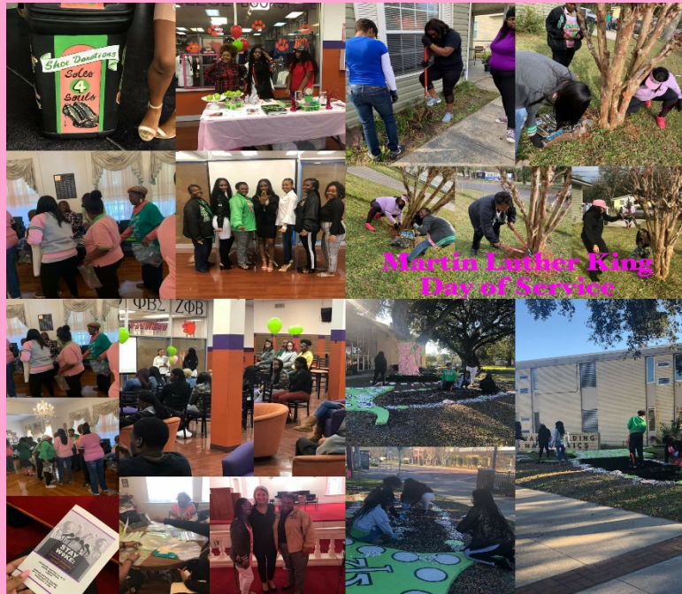
Martin Luther King Day of Service