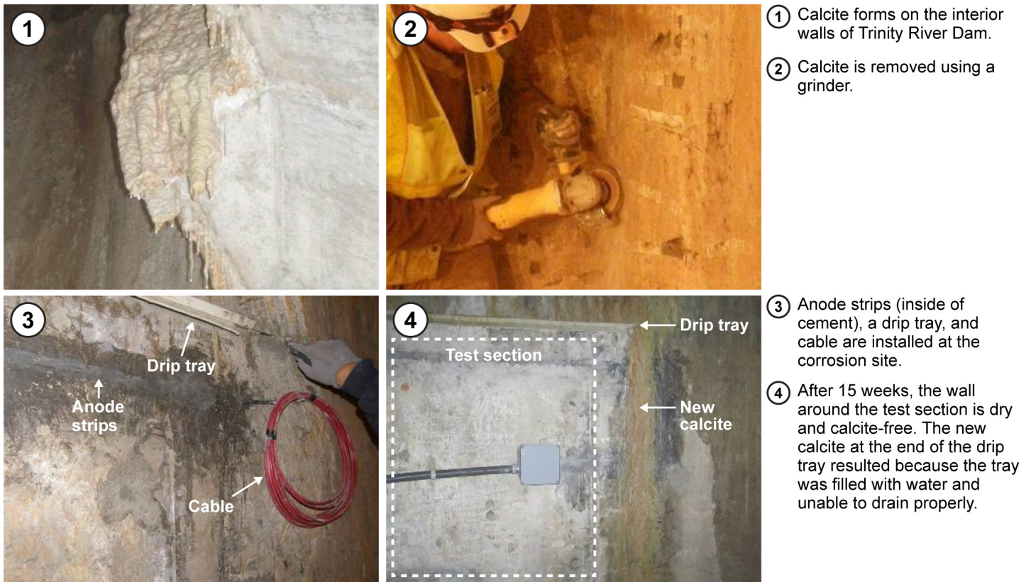
Figure 3: Use of Electro-Osmotic Pulse Technology by the Department of Interior’s Bureau of Reclamation to Prevent Water Leaks on the Trinity River Dam, 2011

Source: GAO analysis of Department of Interior, Bureau of Reclamation, information. | GAO-19-39