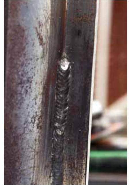
Finished vertical-up weld.

The result is that the weld bead has shallow penetration and a small bead. This longer stick-out makes welding light-gauge material very easy, and perfect for bridging gaps, filling holes and welding projects that have poor fit-ups. This is common when we are rushing.