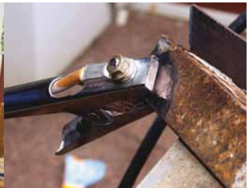
... for clean earth-to-metal contact point.

are also available, normally from 1.6 mm upwards. To my knowledge, aluminum is not available at all.