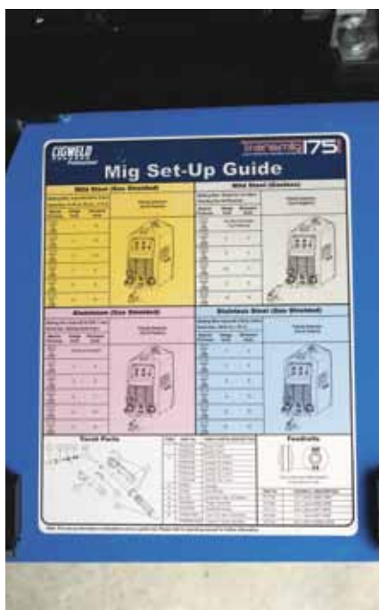
Variables on cover of the machine make adjusting simple.

For gasless welding, polarity changes. Your MIG should be set up with a positive earth and negative electrode.