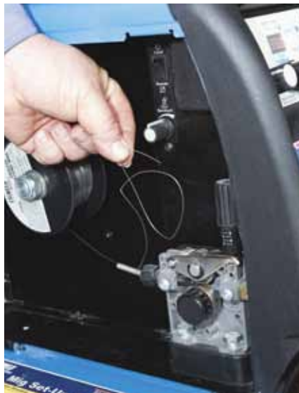
Pig-tail or curled wire can result from screwing down wire-feed tension.