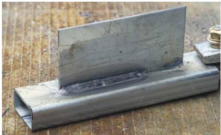
... and weld on galvanised cleaned.