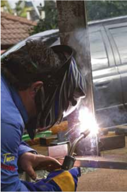
Vertical-up weld (1).

This is unlike stick and MIG using a shielding gas, where negative earth is the norm. This puts more power into melting the wire.