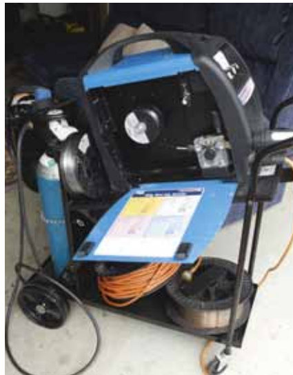
Leaving cover open invites dust and dirt to contaminate wire-feed.

If not, try this. To start, try a setting in the centre of the wire-speed knob