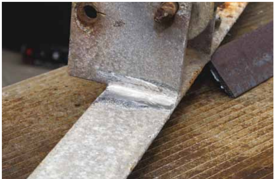
Good practice is to remove coating

The gasless, flux-cored process does not have as fast a deposition rate as hard wire or flux-cored wire using a shielding gas. As it is an electrode