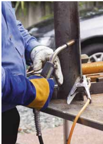
Use upward torch angle for vertical-down weld.

range and the same on the voltage switch. If the wire feels like it is burning off before it reaches the plate, go up one adjustment on the wire-speed knob. Keep going until the wire just starts stubbing or cracking in sound, then wind the knob back. If the wire is stubbing, either go up one adjustment on the voltage knob or one down on the wire-speed knob.