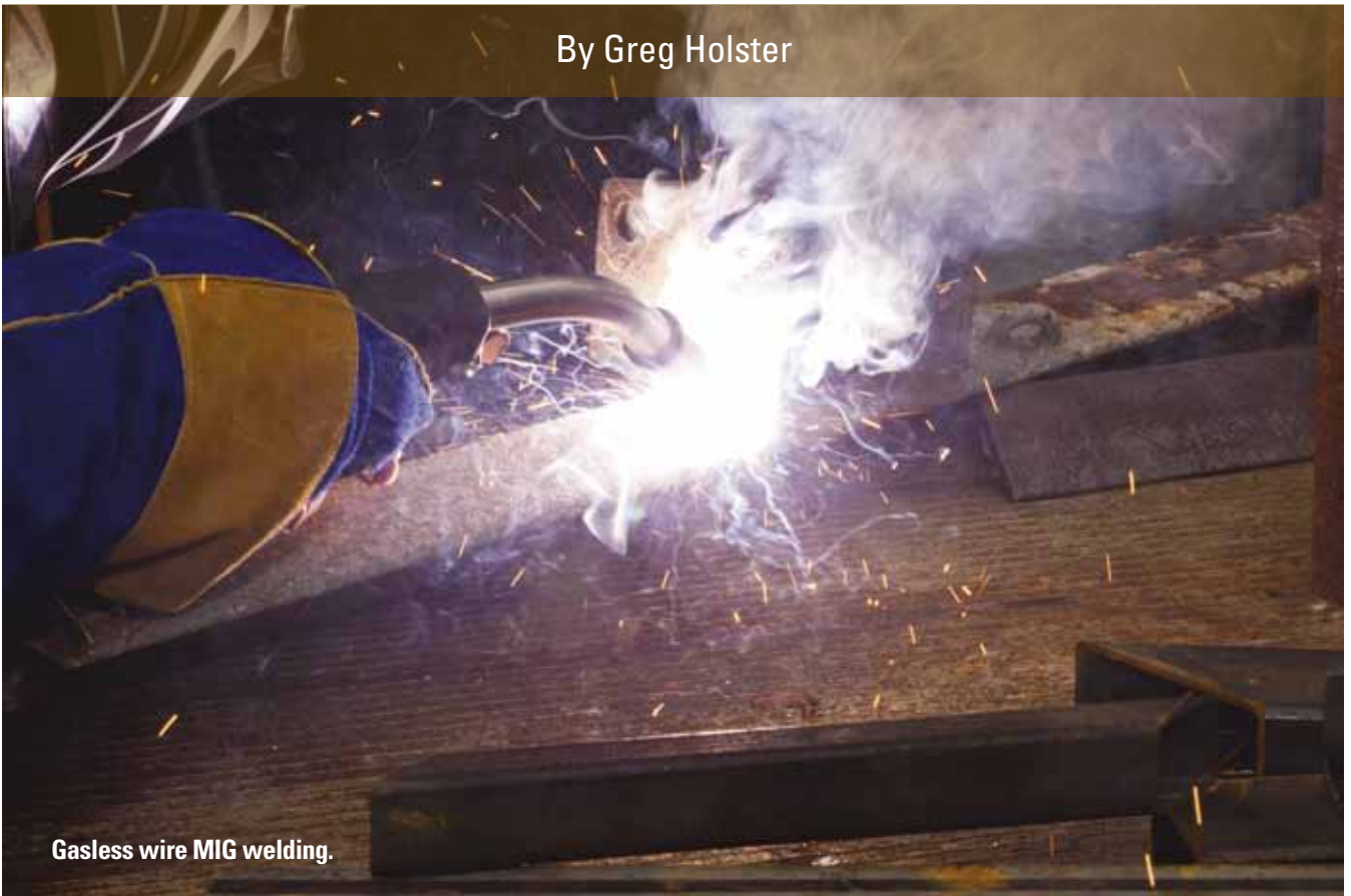
Gasless wire MIG welding.