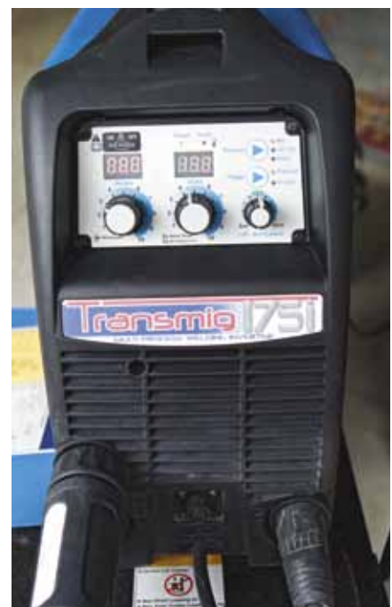
Control knobs for wire-feed speed and voltage.