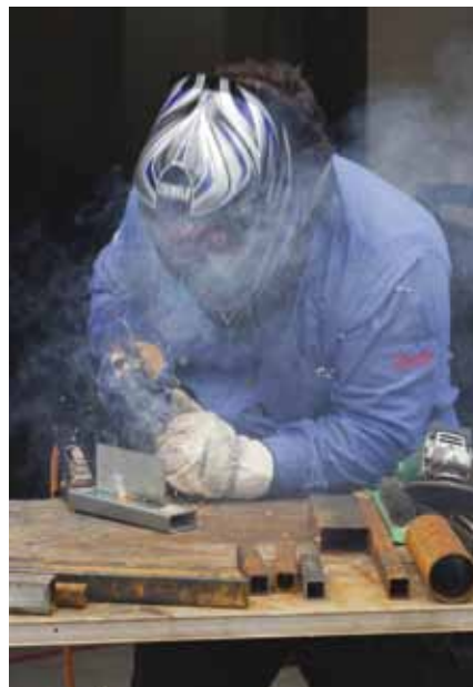
Beware of fumes. This welding is outside in open air.

Of course, you need to be aware of fumes from gasless wire welding. With fumes, all welding should be treated with the same precautions.