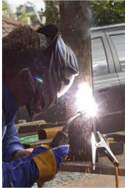
Vertical-up weld (2).

Try welding with the wrong polarity to give you an idea of the difference. On some machines it may work just as well, though most welders will find a big difference. Wrong polarity is a common problem that the inexperienced welder can encounter. Many users I have spoken to who have tried and not liked the gasless process have not been aware of the polarity change; they have been welding with the wrong polarity.