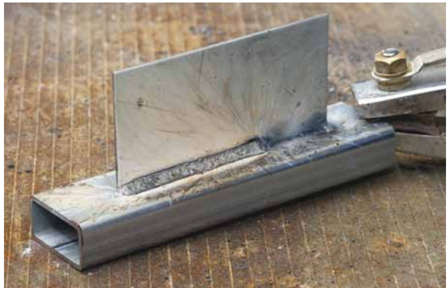
Weld on galvanised...

Gasless flux-cored MIG is a great tool to have in the shed. Mine is set up permanently. I switch it on and start welding. And at the end of the day, that's the name of the game.