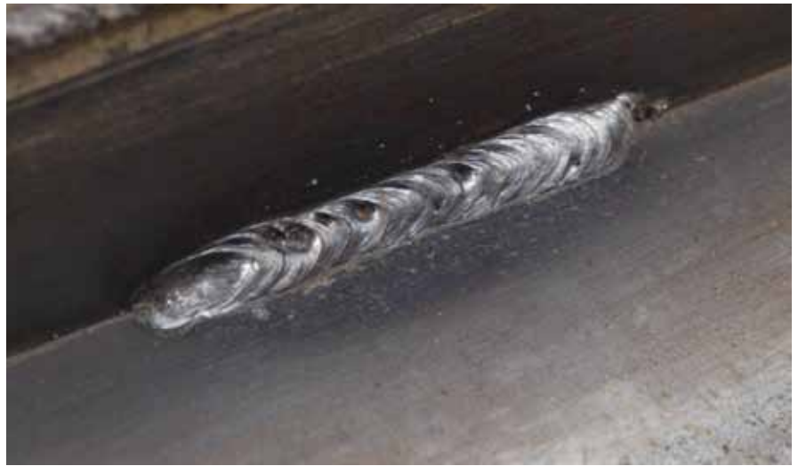
Too high voltage is a common cause of porosity.

secret is to keep your movements steady. Moving fast or whipping the arc will give you lumpy welds because the weld pool has got hot and cold too quickly. Generally, keep the wire nearly perpendicular to the joint for vertical-up welds.