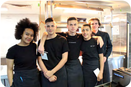
**MORE PHOTOS ON NEXT PAGE**

The function enabled students to learn about the importance of teamwork as well as how to work under pressure. Students were responsible for creating individual time plans to follow on the day, to ensure all jobs were successfully completed, and in a timely manner. On the day of the function, students were split up into groups; front of house, back of house and drinks. All students worked very hard at their given job to create a great atmosphere for the customers.