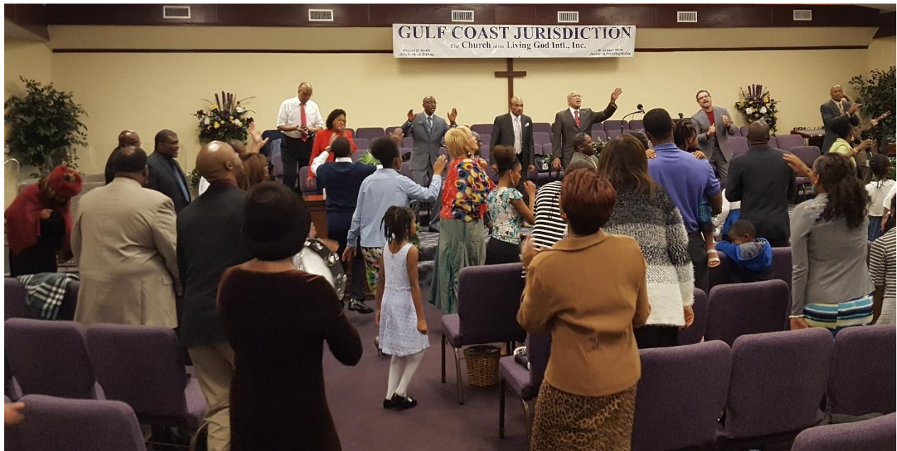
In the photo: Saints praising the Lord during the Gulf Coast Jurisdictional Meeting.

Saints encouraged to unify and stand strong in the Lord