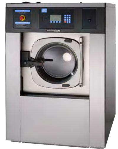
20- to 255-pound capacities