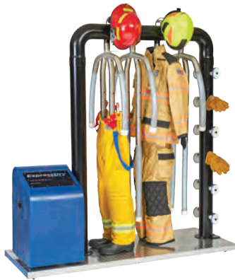
XD-4 ExpressDry Gear Dryer*