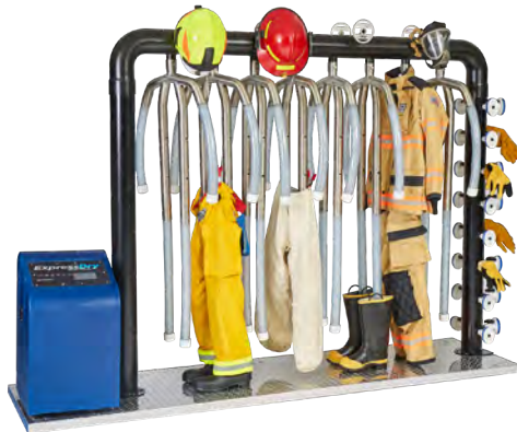
XD-8 ExpressDry Gear Dryer*