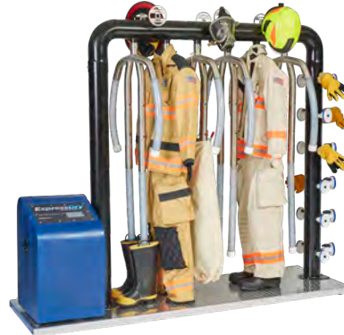
XD-6 ExpressDry Gear Dryer*