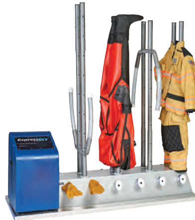
XD-IHT ExpressDry Special Ops Gear Dryer*

* Models also available as heated units.