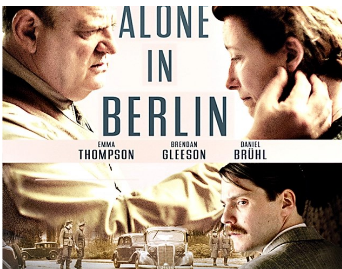
Alone in Berlin, movie poster (2017)