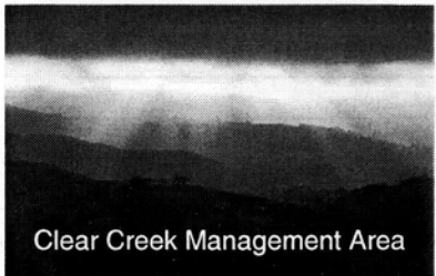
Clear Creek Management Area

CCMA RMP Bureau of Land Management Hollister Field Office 20 Hamilton Court Hollister, CA 95023