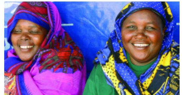
UN Agencies and the Government of Burundi launch a 'back to school program' as peace returns to Burundi.

Despite these developments, progress has stalled or slowed in some areas. Gender-based violence continues to threaten the security of women in post-conflict environments, and even though steps have been taken among UN entities at inter-agency levels to address this scourge, the response remains far from adequate. In addition, reporting on gender issues through formal mechanisms available within DPKO remains limited. As a result, peacekeeping personnel and key partners remain largely uninformed about the nature, type and impact of gender mainstreaming activities overall. On another level, efforts to increase the number of female personnel in peacekeeping have not resulted in any noticeable shift. At the highest levels of decision-making, the number of female Special Representatives of the Secretary-General remains two out of a total of seventeen.