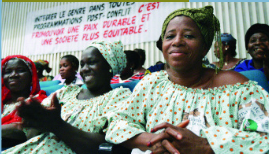
Photos this page, clockwise from top left: A UN Stabilization Mission in Haiti peacekeeper, who is providing security for a mass in which the Prime Minister of Haiti, and the Special Representative of the Secretary-General for Haiti participate, chats with a young girl outside of the cathedral.; President Ndayizeye from Burundi (second in line) registers for elections at a suburb of Bujumbura.; Cote d'Ivoire women gather to celebrate International Women's Day at the Palais de la Culture in Abidjan.; In order to participate in the demobilization and reintegration program a woman ex-combatant hands over arms and ammunition to a UN Peacekeeper in Liberia.

The following section provides a snap-shot of the work of gender units in peacekeeping missions with full-time gender advisory capacities (Afghanistan, Burundi, Côte d'Ivoire, the Democratic Republic of the Congo, Haiti, Kosovo, Liberia, Sierra Leone, Sudan and Timor-Leste). The Offices of Gender Affairs in UN peacekeeping missions are responsible for supporting the implementation of Security Council Resolution 1325. To this end, they work with mission personnel – civilian, military and civilian police – to provide practical guidance on strategies for addressing the specific needs of women and men in transitional processes. Gender units also support capacity development of national counterparts throughout the transitional period – governmental and non-governmental organizations and women's groups. In doing so, they collaborate closely with other UN partner agencies in order to enhance complementarity and impact of this work both during and well beyond the transitional period.