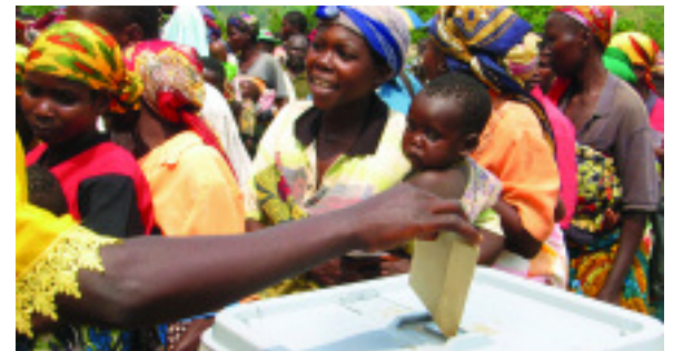
Women in Burundi turn out in large numbers to vote. The post-conflict environment has proven to be very conducive to securing better rights for the women of Burundi and introducing real change.

To mark the five-year anniversary of the adoption of resolution 1325, DPKO is developing a Department-wide action plan for the implementation of the resolution, as called for by the Security Council in 2004 and underlined in the Under-Secretary-General's policy statement. The Action Plan will provide a framework for ensuring a more coordinated approach to gender mainstreaming, and for supporting broader accountability for implementation of the resolution within sections of the Department. It will outline key objectives, outputs and progress measures for implementation of the resolution as part of the programme of work for each Office in DPKO. The Action Plan design process, as a part of a series of workshops helped staff in each office at DPKO, including those in the military, police, operations and mission support units, to elaborate concrete objectives, outputs and indicators for implementation of resolution 1325 within their respective work areas. The DPKO Action Plan will be an important complement to the UN system-wide action plan coordinated by the Office of the Special Adviser on Gender Issues and will provide a more detailed elaboration of the broad objectives outlined in the system-wide plan.