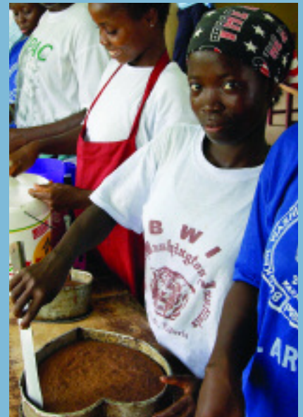
Photos this page, clockwise from top left: Mbanda, south of Burundi. Female ex-combatant surrenders weapons and ammunitions to the UN registration desk. People fight for ONUB flyers after the performance of inter-active Theater troop TUBIYAGE in the Kabezi, Burundi public square. The performance sensitized the population about voter registration. The OGA encourages the women of Liberia to check their names against voter registration lists. Ex-combatants participate in skill training as part of the rehabilitation and re-integration process, Kakata, Liberia. Elderly refugee woman about to enter into the former Yugoslav Republic of Macedonia at the Blace Official Border Crossing.