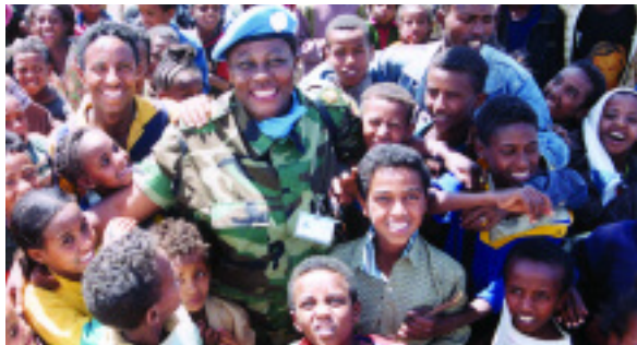
Peacekeeper sharing the joy of children in a host country.

Gender units are operating at different levels in terms of human resource capacities to support their work. There is a need to harmonise the staffing of gender units to reflect the scope of the mandate and size of peacekeeping missions, and to attract more qualified men to serve on the staff of gender units. Moreover, the need to ensure financial resources to facilitate the work of gender units is key, given that their mandate is to support gender mainstreaming inside the missions, as well as externally engaging and supporting women's contributions to all aspects of transitional processes.