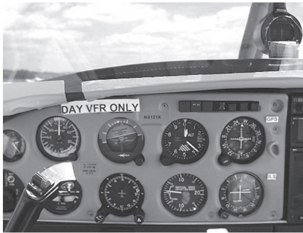
Figure 1. Archer instrument panel.