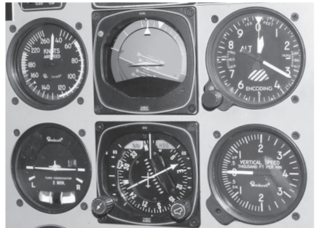
Figure 2. Bonanza instrument panel.

the windshield material. This arrangement allowed the pilots to see inside the cockpit, but eliminated the outside view immediately above the glare shield.