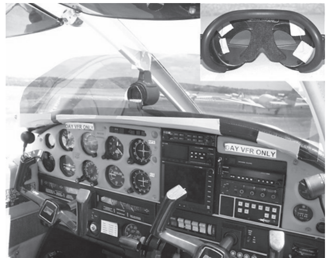
Figure 3. Polaroid material across windscreen of Piper Archer with (inset) Francis hood.

Data recording. Several forms of data were recorded for each flight. Flight performance data were recorded via a Cambridge Aero Instruments GPS Navigator and Secure Flight Recorder. This generated a plan-view map and vertical-profile view of the flight path for the purpose of assessing average and maximum flight-path deviations. A color digital video recording was also obtained during the flight with audio of all intercom/radio communications. The field of view of the camera, which was attached to the cabin headliner