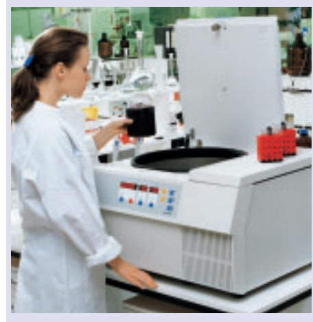
Megafuge® 1.0 R – general purpose refrigerated tabletop centrifuge