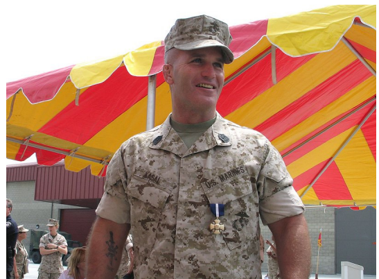
SgtMaj Kasal shown wearing the Navy Cross.