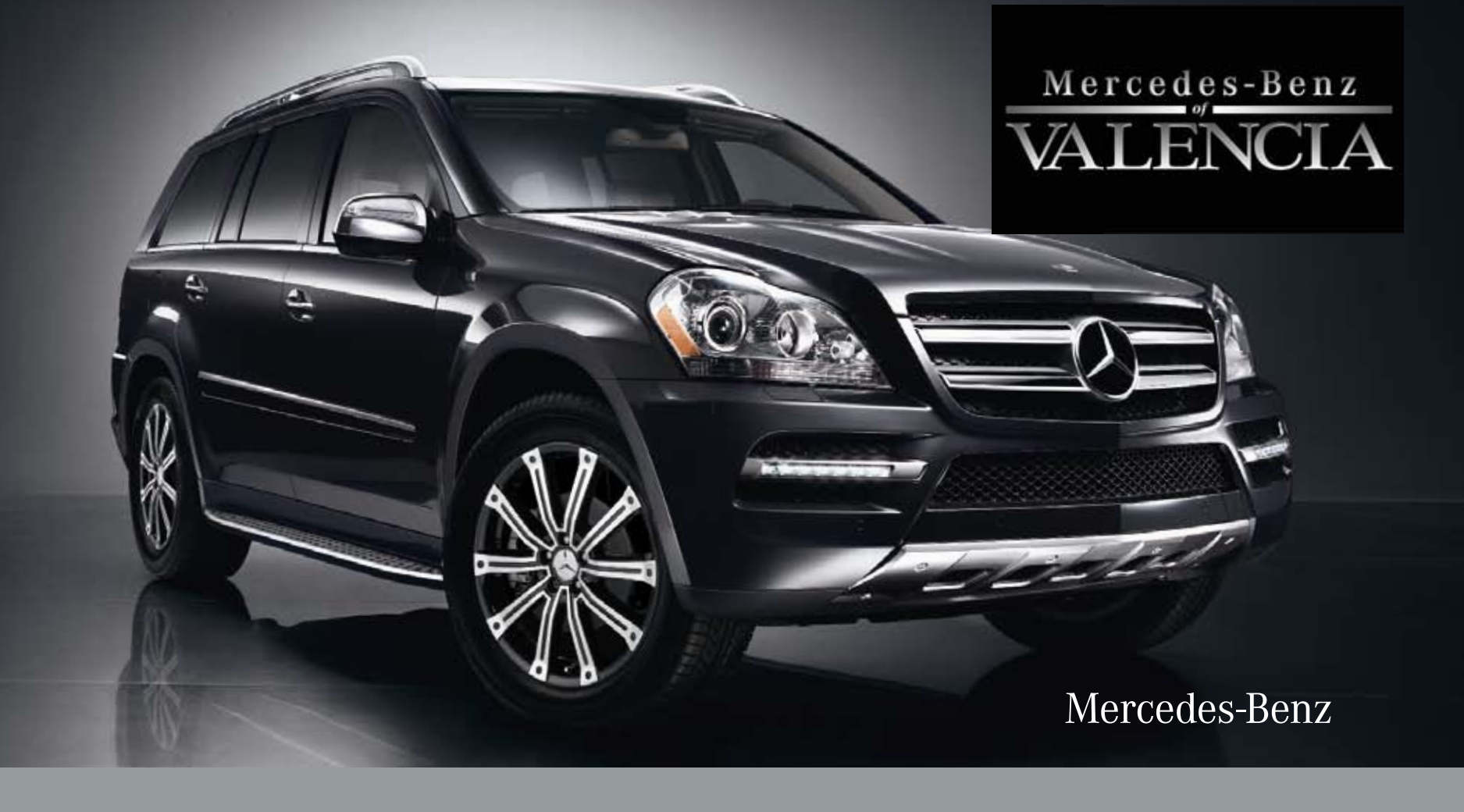
Genuine Accessories for the GL-Class