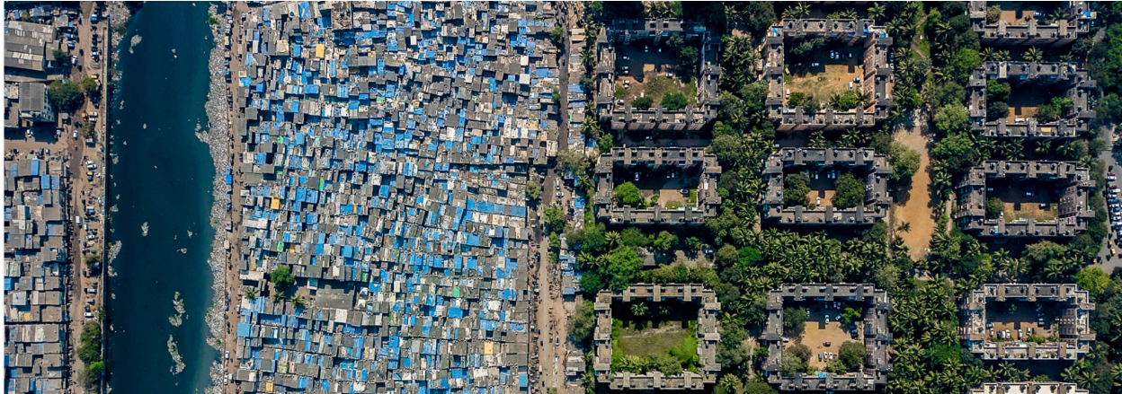
clashing built form near Bandra-Kurla, Mumbai