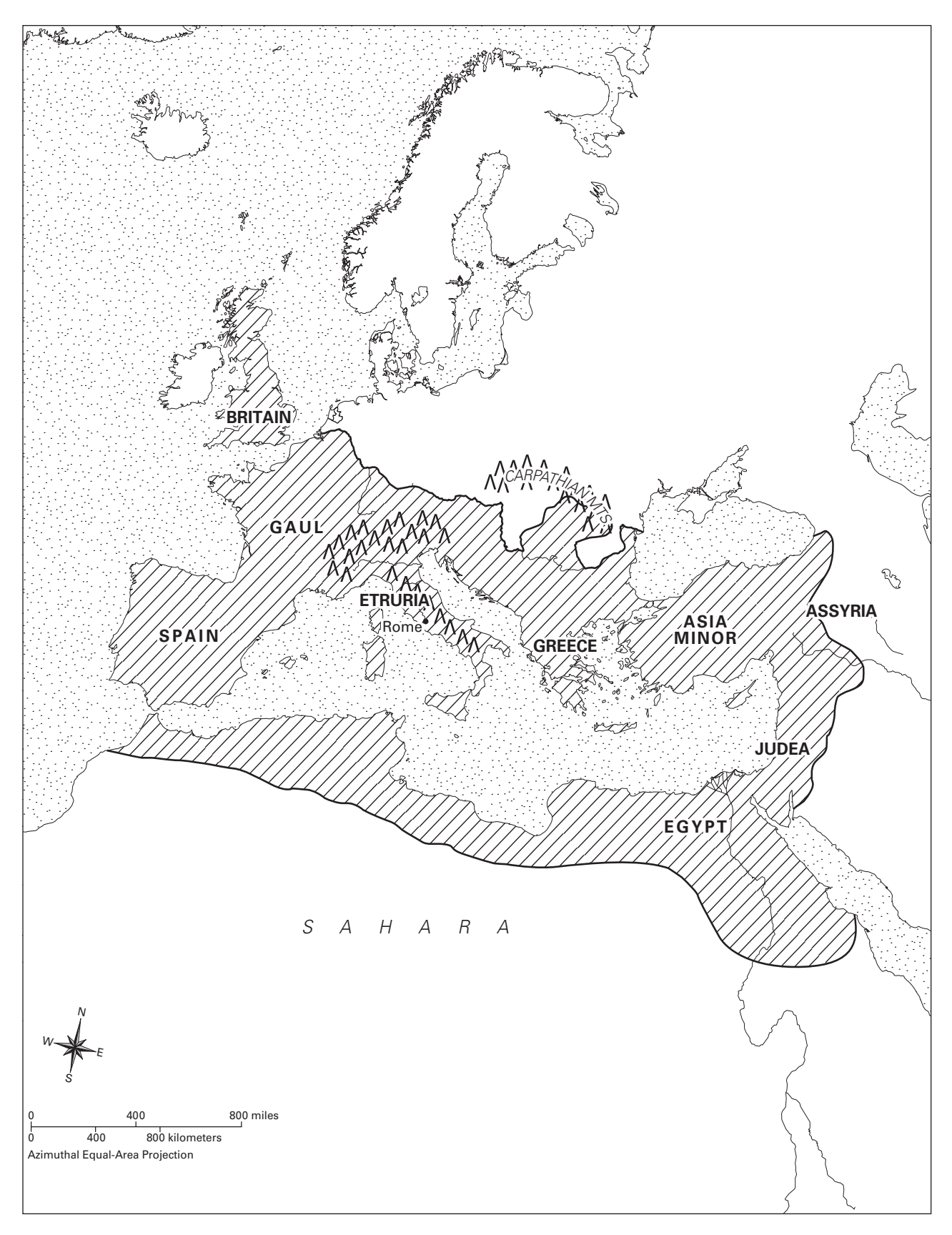
The Roman Empire, About 117 C.E.