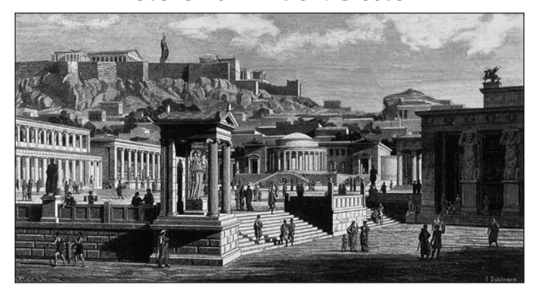
Scene from Ancient Rome