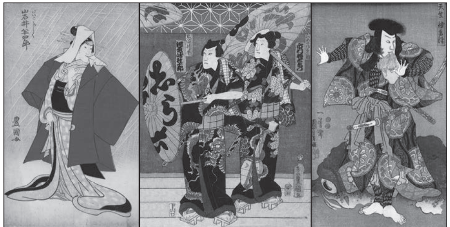
Kabuki Woodblock Prints, 17th and 18th century

Emperor Qin Shi Huang, first (and only) emperor of the Qin Dynasty of China, was buried with an army of over 8,000 terracotta warriors, horses, and chariots, which were meant to guard him in the afterlife.