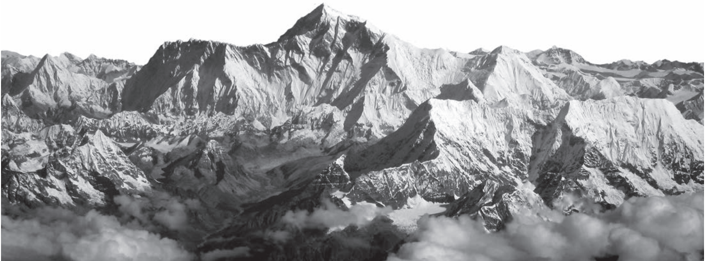
Summit of Mount Everest in the Himalayas

There are two main rivers that sustain life and foster transportation in China. The Yellow River (or Huang He , as it is known in China) flows through the Northern China Plain. The Yellow River has been called "the cradle of Chinese civilization"; it provides a livelihood for millions of people. As the river flows down from the Tibetan Plateau, it brings deposits of silt, which have caused many devastating floods throughout history, causing millions of deaths. In