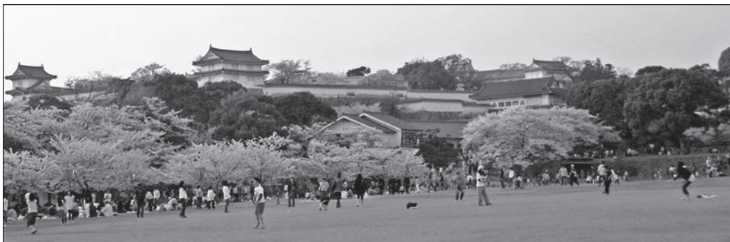
Himeji Castle, Japan

Kabuki is a type of drama developed in Japan in the 17th century. Kabuki plays incorporate elaborate costumes and makeup, dance, and the use of shocking reveals or reversals as plot conventions. Woodblock prints of popular plays or famous actors were a common type of art in Japan during the height of Kabuki popularity in the 17th to 19th centuries.