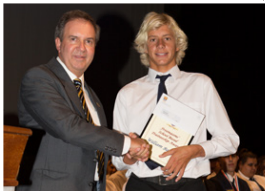
William Barrett Freemasons VET Award