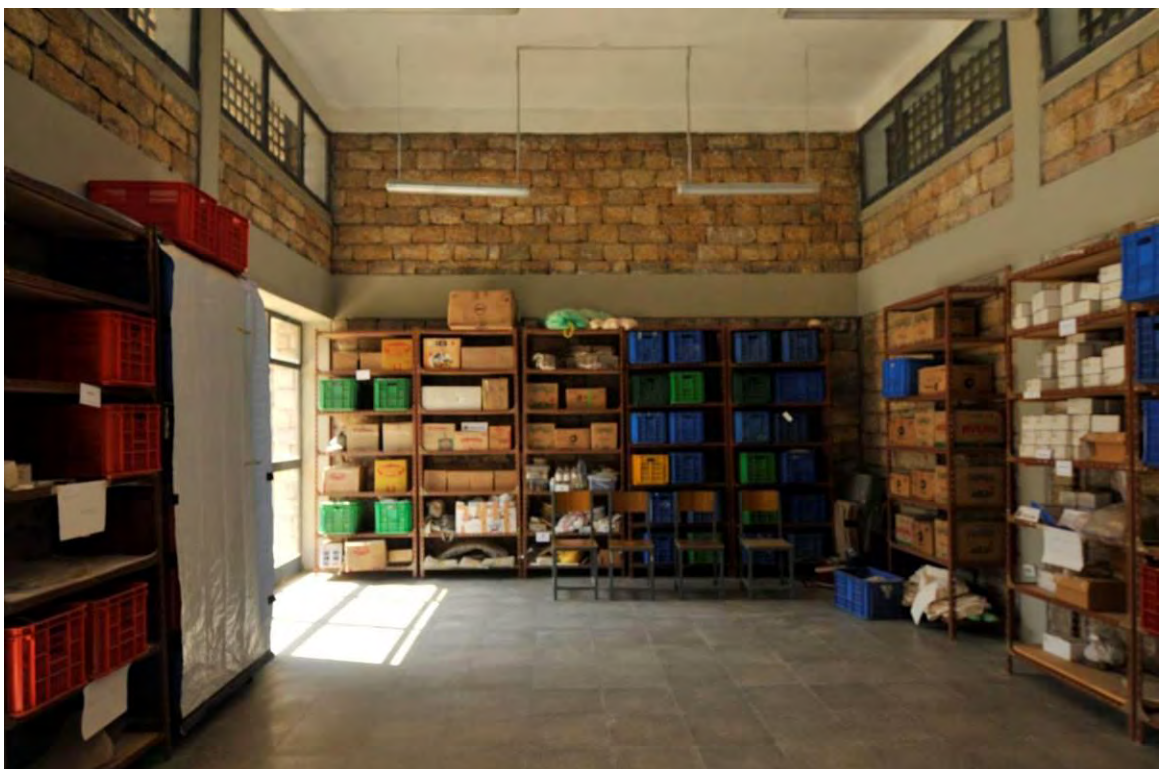
Figure 11: reorganising the archaeology magazine and advising on its use at the Wukro Museum.