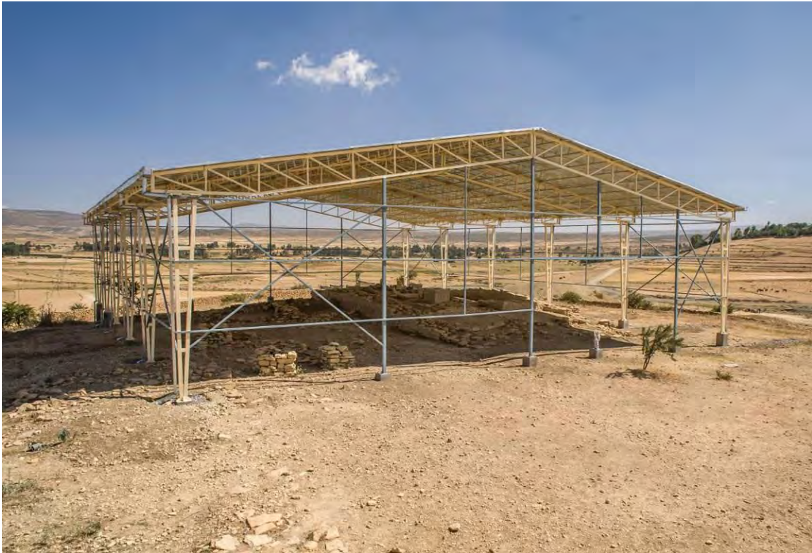
Figure 2: the pre-Aksumite religious complex at Meqaber Ga'ewa, with its temple dedicated to the Sabaean deity Almaqah, now reconstructed as an open air museum with protective shelter.