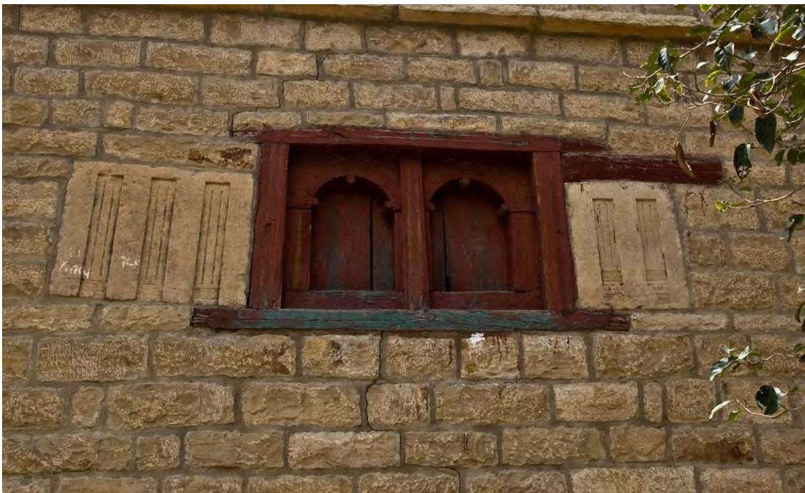
Figure 5 remains of a pre-Aksumite Sabaean altar, now incorporated into the window of the west wall of the main church building at Abuna Garima.