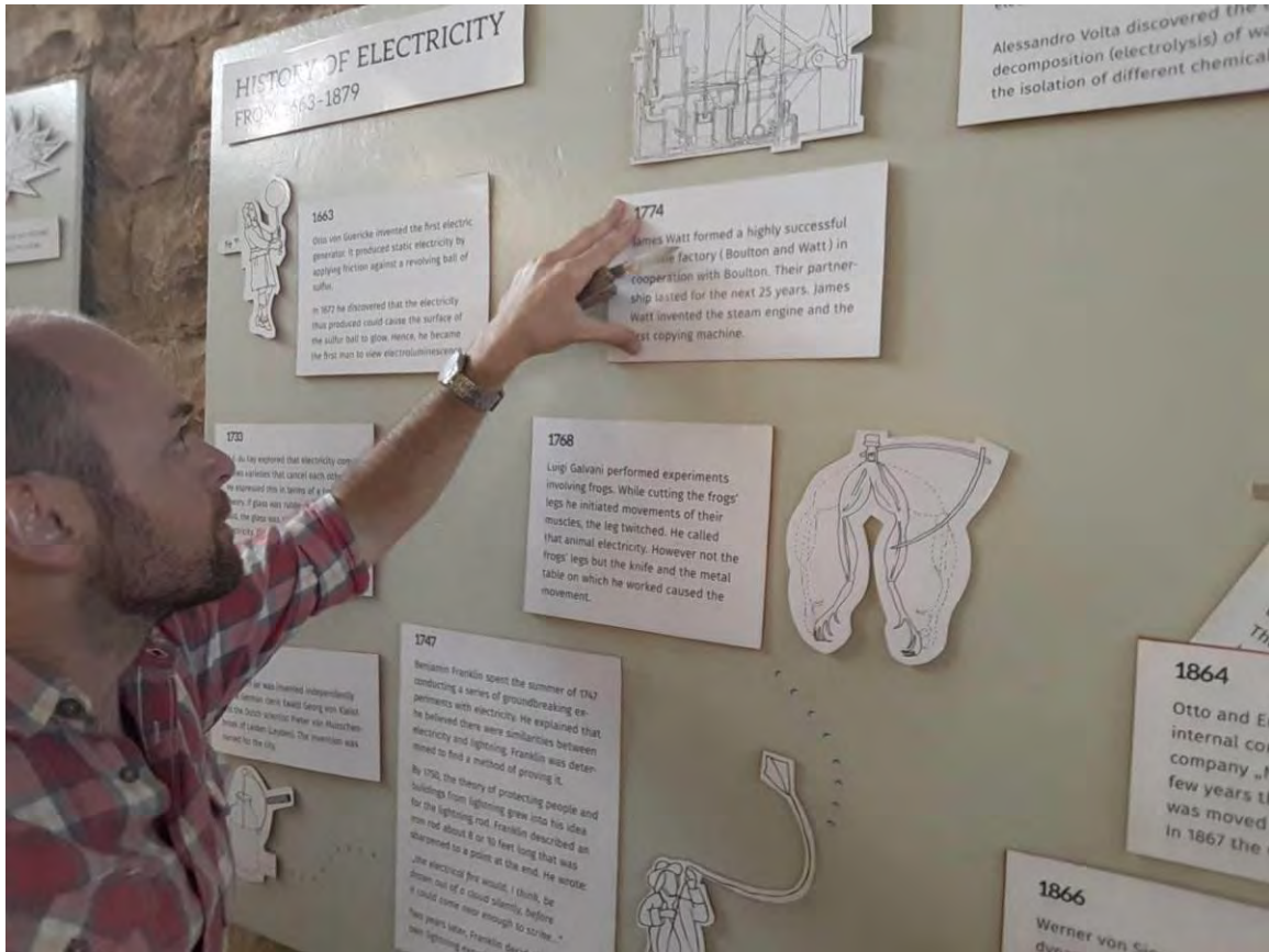
Figure 12: helping to restore some of the displays in the Wukro Museum.