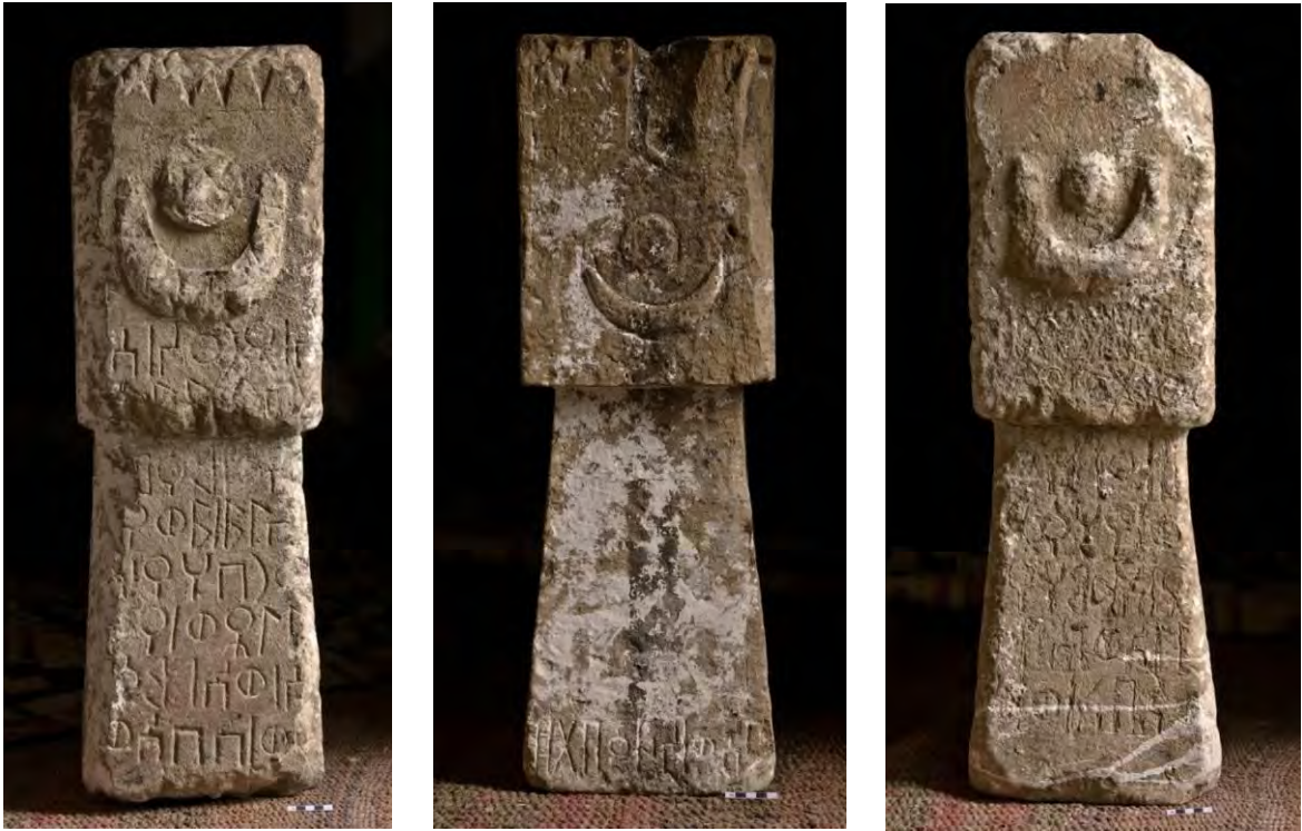
Figure 4: the pre-Aksumite Sabaean stone incense burners. currently stored inside the main church building at Abuna Garima.