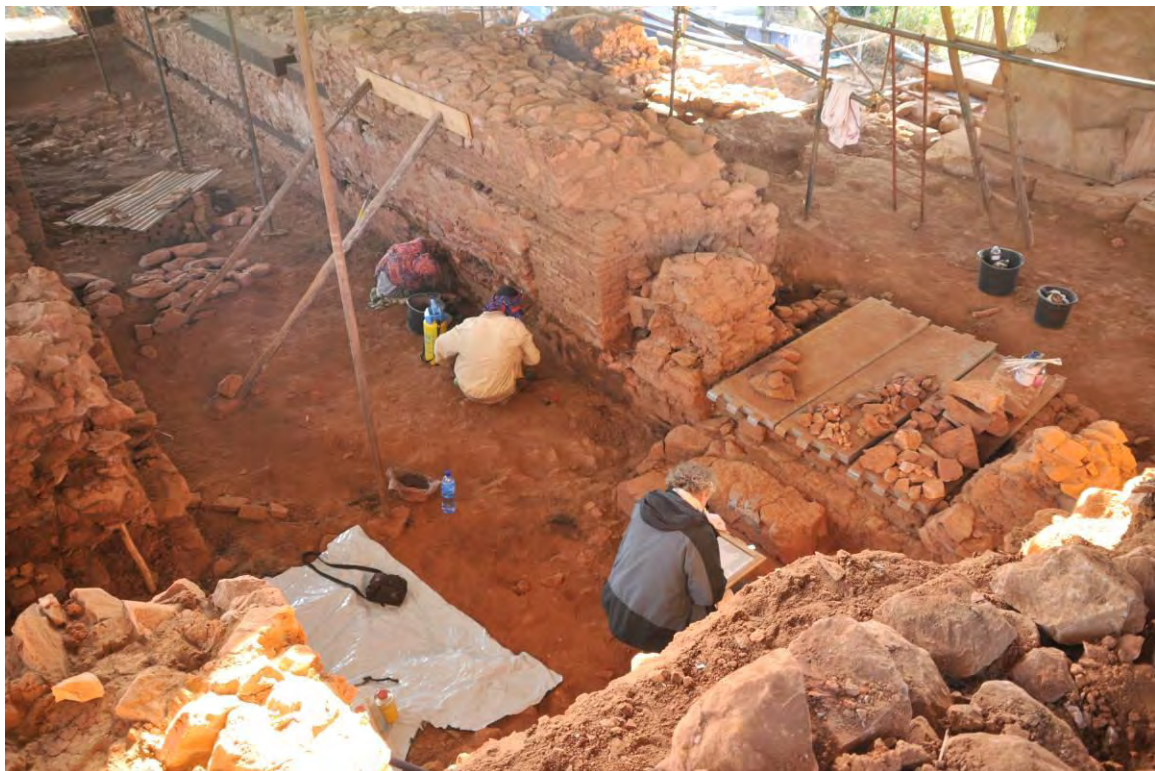
Figure 13: villagers from Yeha employed to assist with the conservation work on the Grat Be'al Gebri in Yeha.