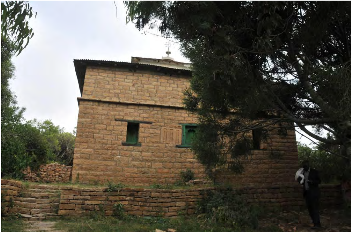
Figure 10: the main church building of Abuna Garima.