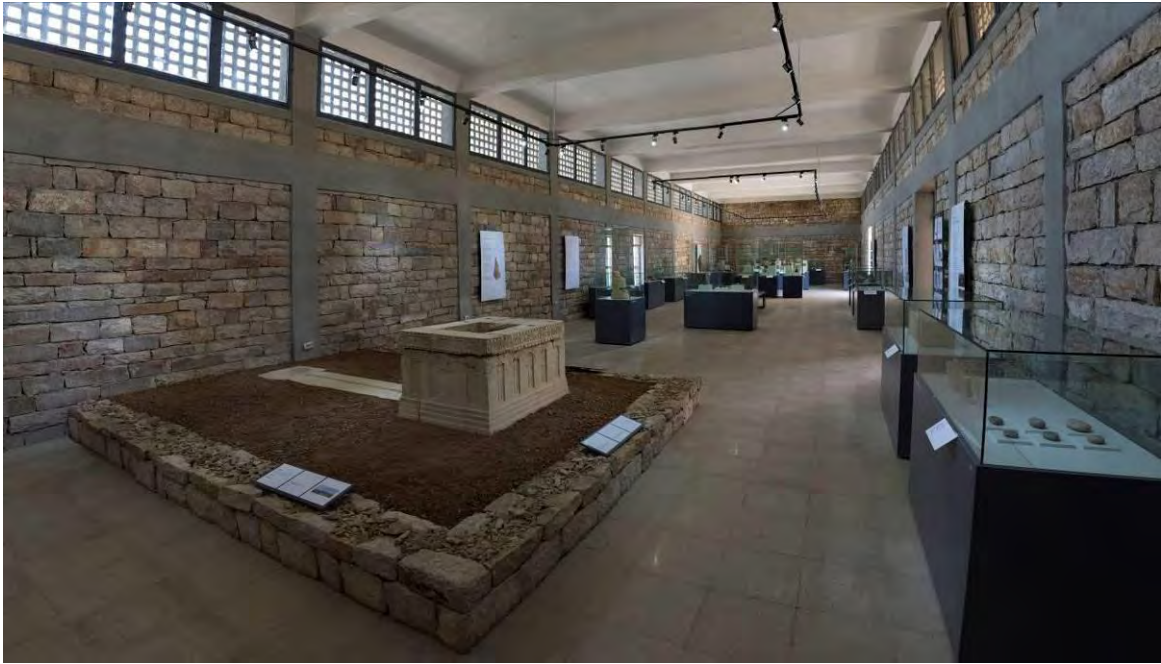
Figure 6: the pre-Aksumite Sabaeen altar from Meqaber Ga'ewa, now on display in the Wukro Museum.