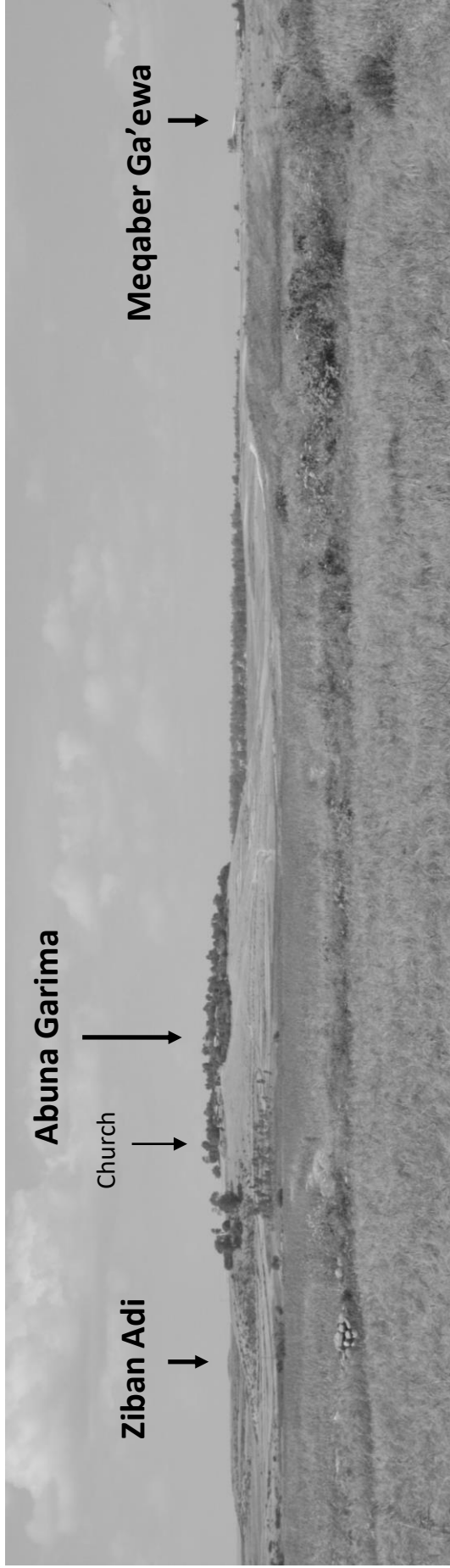
Figure 1: the landscape of Addi Akawah.