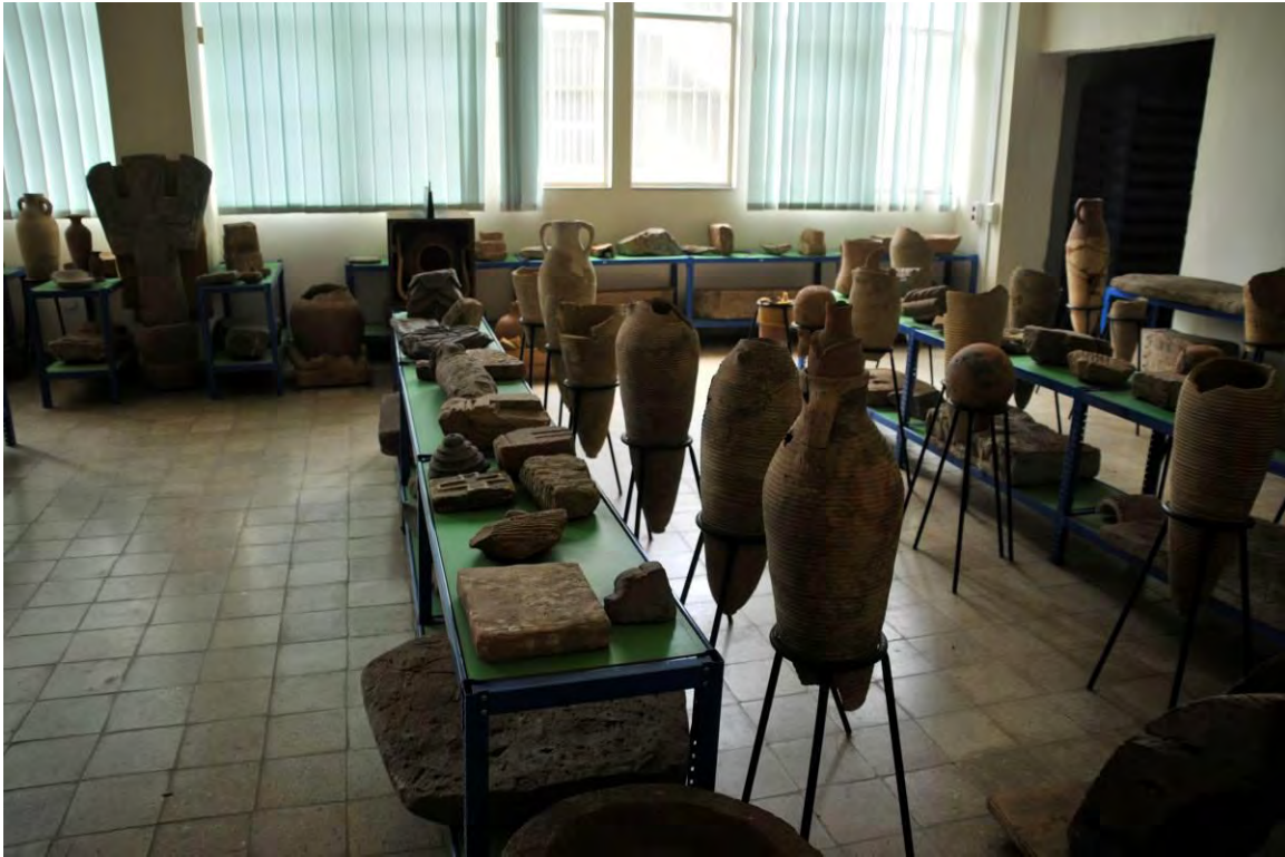
Figure 14: artefacts of the pre-Aksumite period in the archive of the National Museum of Ethiopia in Addis Ababa.