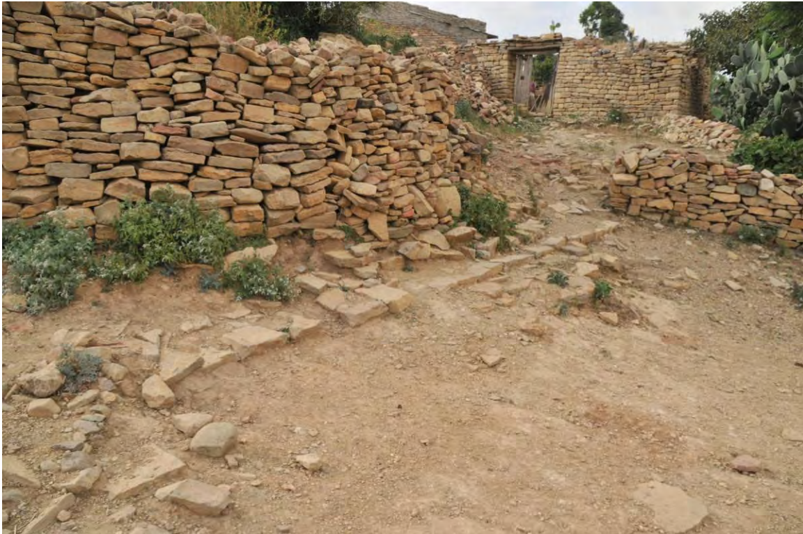
Figure 8: the structural remains of the corner of a building identified in Area 3 of the survey of Abuna Garima.