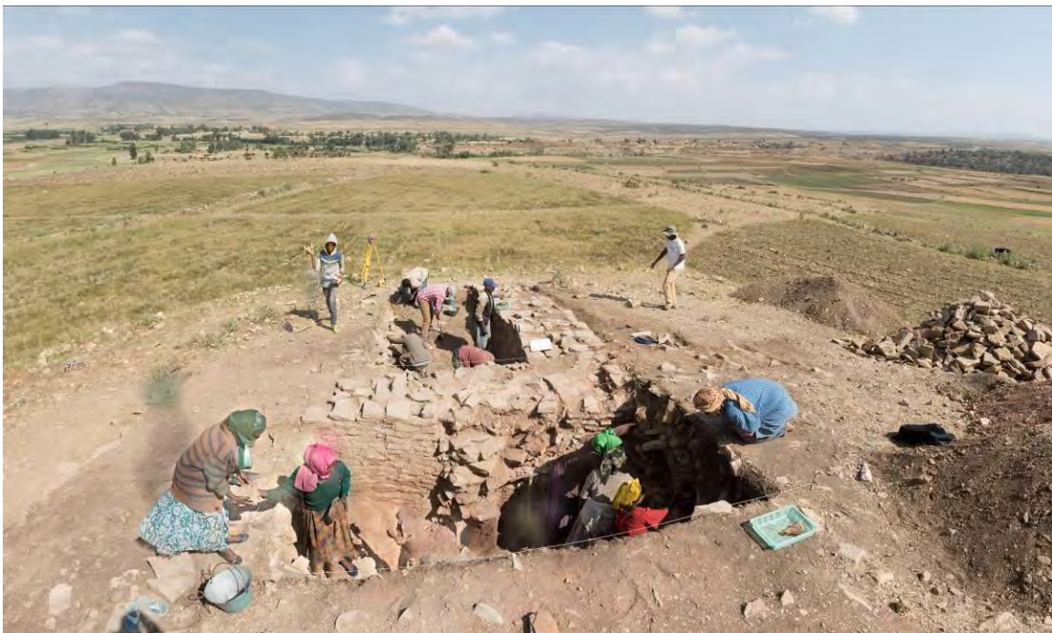
Figure 3: the pre-Aksumite residential building at Ziban Adi, during excavation in 2015.