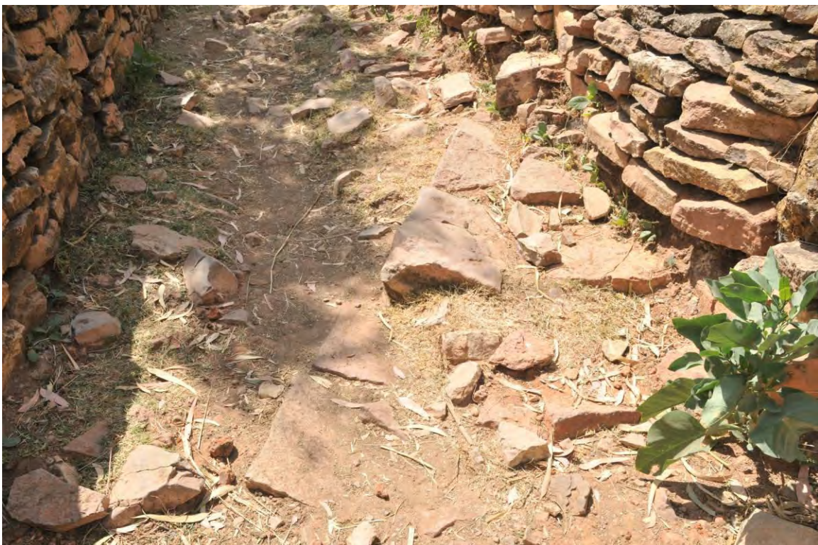
Figure 9: the remains of one of three identical stone walls identified in Area 3 of the survey of Abuna Garima.