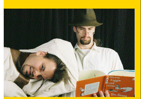
Flying Cat Circus

Movie Showtimes Nightly: 7:30 p.m., 10:30 p.m., & 1:30 a.m.