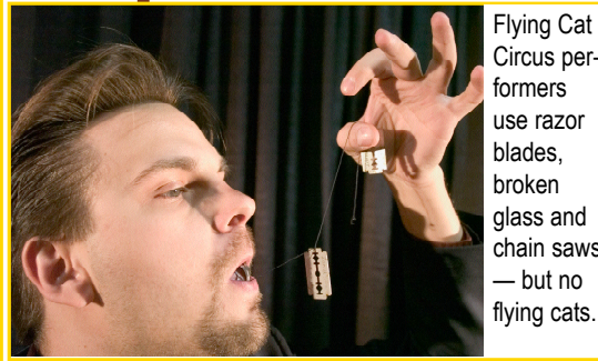
Circus performers use razor blades. broken glass and chain saws - but no flying cats.

(See a full schedule of events on the next page)