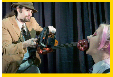
Flying Cat Circus