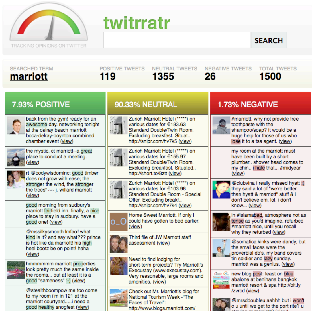
Figure X.X.: Tools like twitrratr attempt to classify the sentiment behind tweets mentioning a key word or phrase. Savvy firms can mine comments for opportunities to provide thoughtful customer service (like the suggestion at the top right to provide toothpaste for those who lose it in U.S. airport security)

Facebook provides a summary of fan page activity to administrators (including stats on visits, new fans, wall posts, etc.), while Facebook’s Insights tool measures user exposure, actions, and response behavior relating to a firm’s Facebook pages and ads.