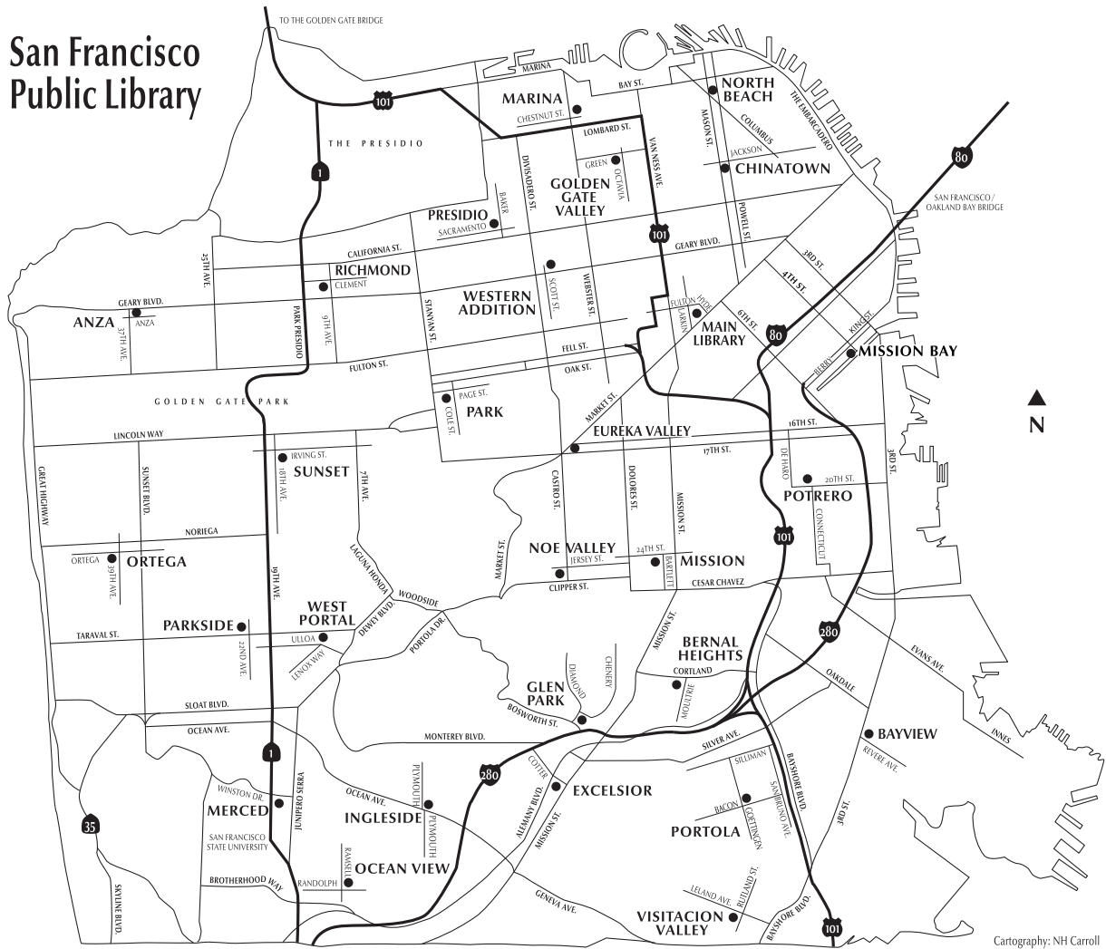
Cartography: NH Carroll